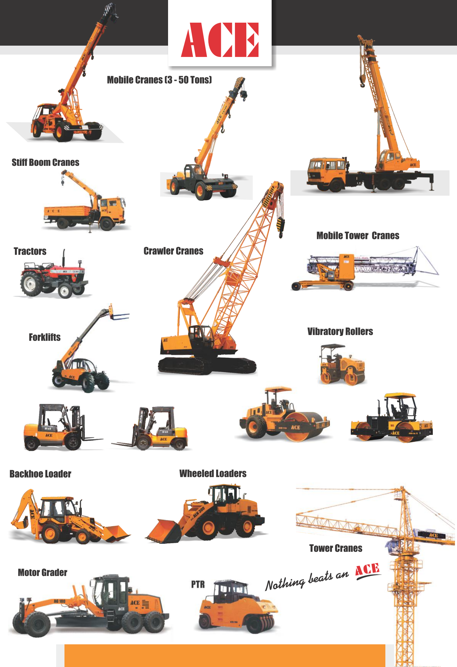
Mobile Cranes (3 - 50 Tons)