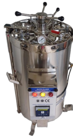
Vertical Autoclave Radial Locking