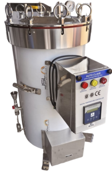
Vertical Autoclave Knob Locking