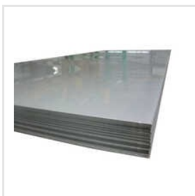
Industrial HRPO Sheet