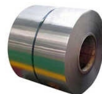
INDUSTRIAL CR COIL