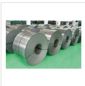
Industrial HRPO Coil