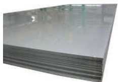
INDUSTRIAL HRPO SHEET

Industrial CR Coil, Industrial HRPO Coil, Industrial HRPO Sheet, etc.