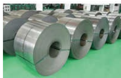
INDUSTRIAL HRPO COIL