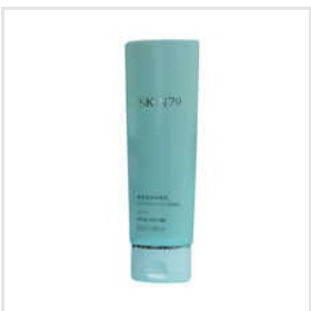
100ml Soft And Dense Facial Cleanser