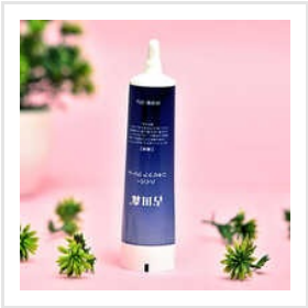
30g Nozzel Packaging Tube