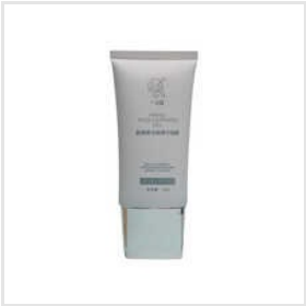
50g Amino Acidcleansing Gel