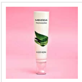
Aloe Vera Plastic Pump Packaging Tube