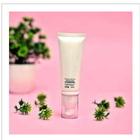
50ml Plastic Pump Packaging Tube