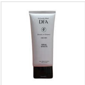
Skin Brightening Face Wash Packaging Tube