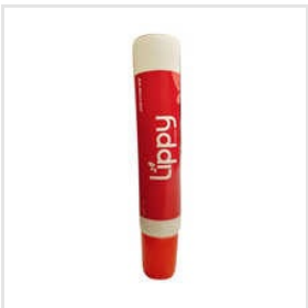
Plastic Lip Balm Packaging Tube