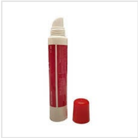
Customized Lip Balm Packaging Tube