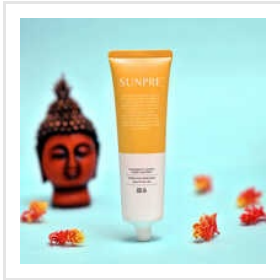
Sunscreen Packaging Tube