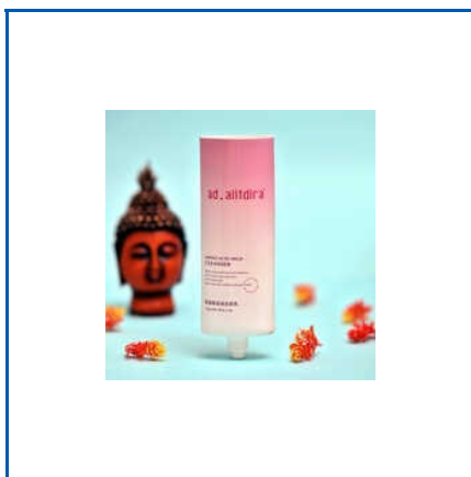
120G AMINO ACID MILD CLEANSER PACKAGING TUBE

100g Sun Shield Cream Packaging Tube, 100ml Round Shape Packaging Tube, 100ml Packaging Tube, 100ml Soft And Dense Facial Cleanser Packaging Tube, 120g Amino Acid Mild Cleanser Packaging Tube, 150g Cleanser Oval Packaging Tube, 200g Hair Shampoo Packaging Tube, 30g Meizida Oval Packaging Tube, 30g Nozzel Packaging Tube, etc.