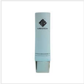
30g Meizida Oval Packaging Tube