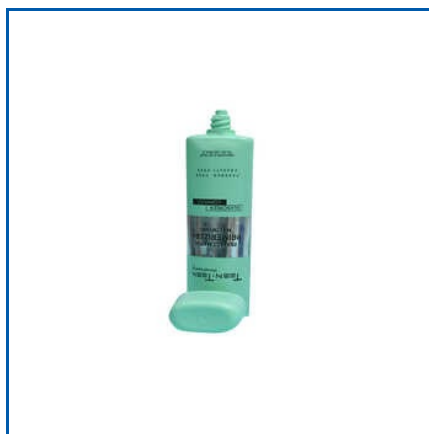
SILKSCREEN PACKAGING TUBE