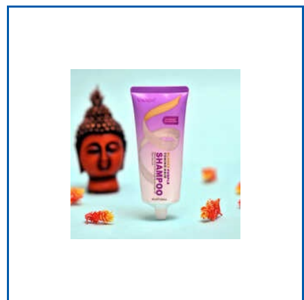
100ML PACKAGING TUBE