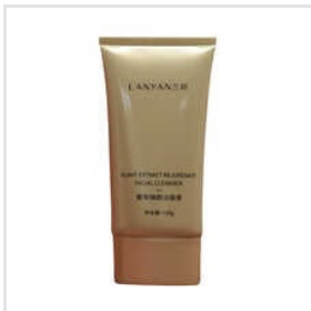
150g Cleanser Oval Packaging Tube