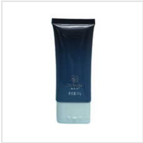
30g Terasu Oval Packaging Tube