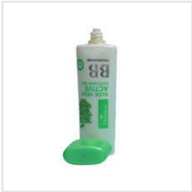
Aloe Vera Active Soothing Gel