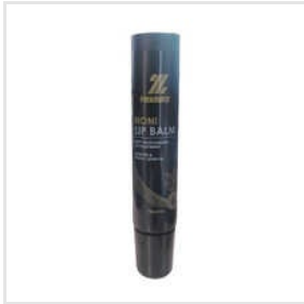
Noni Lip Balm Packaging Tube