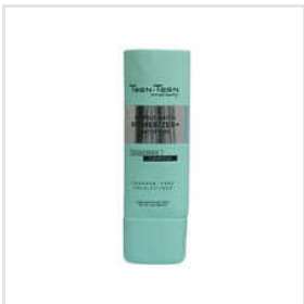
Sunscreen Complex Oval Packaging Tube