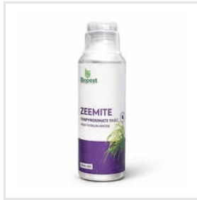
Zeemite Fenopyroximate 5% EC