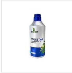
Polestar Bifenthrin 10% EC W-W Insecticides