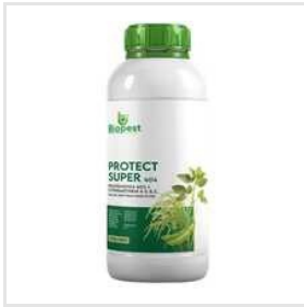
Protect Super Profenophos 40% Plus