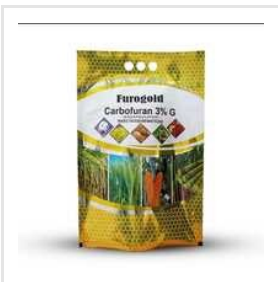
Furogold Carbofuran 3% G Insecticides