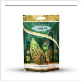
Crutap 4G Cartap Hydrochloride 4% GR