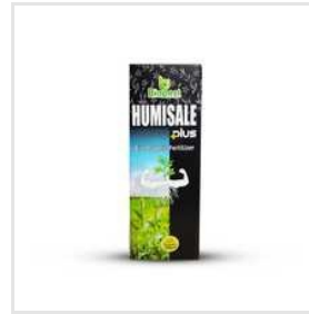
Humisale Plus Humic 12% Fulvic 2% Amino 2%