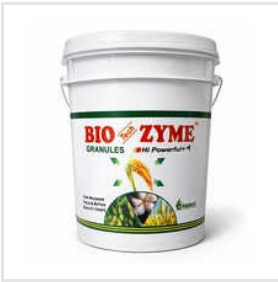
Bio Zyme Granule For Plant Growth