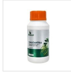
Swatantra Tebuconazole 10% Plus