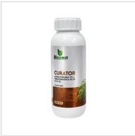
Curator Azoxystrobin 11% Plus Tebuconazole