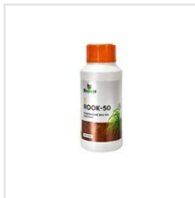
Rook-50 Pymetrozine 50% WG Insecticides