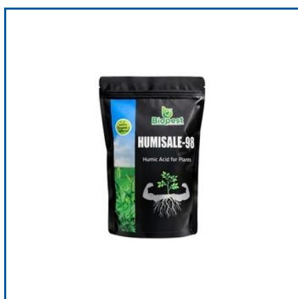
HUMISALE-98 HUMIC ACID SHINY FLAKES

Agent 3G Fipronil 0.3% GR Insecticides, Aghori All Purpose Pest Control Expert Spray, Ajooba 100% Organic Growth Booster, BP-KMB Potash Mobilizing Bio Fertilizer, Bio Zyme Granuule For Plant Growth, Bioverm Vermi Compost, Corona Silicon Based Spreader, Crutap 4G Cartap Hydrochloride 4% GR Insecticides, Curator Azoxystrobin 11% Plus Tebuconazole 18.3% SC Fungicides, etc.