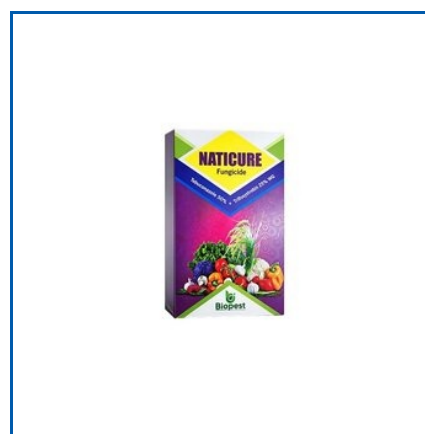
NATICURE TEBUCONAZOLE 50% PLUS TRIFLOXYSTROBIN 25% WG FUNGICIDES