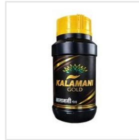
Kalamani Humic Acid Plus Fulvic Acid Plus