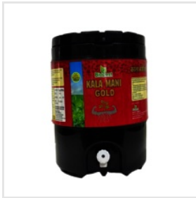
Kalamani Gold Humic Acid Plus Fulvic Acid