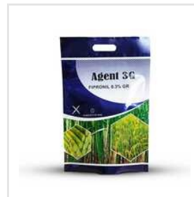
Agent 3G Fipronil 0.3% GR Insecticides