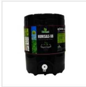
Humisale-98 Humic Acid Shiny Flakes