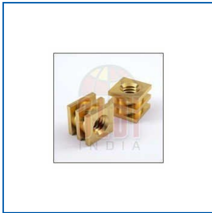
BRASS TRIPLE SQUARE INSERTS