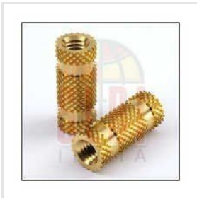
Brass Triple Knurling Inserts