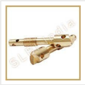
Brass Sealing Screw