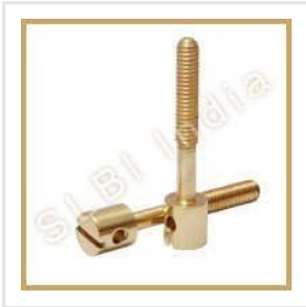
Brass Electric Meter Screw