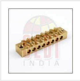
Brass Earth Bars