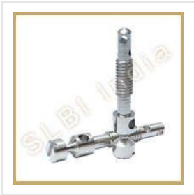
Brass Electrical Meter Screw