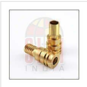
Brass Turned Components