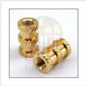
Brass Cross Knurling Inserts