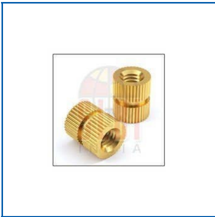
BRASS STRAIGHT KNURLING ROUND INSERTS

Brass Battery Terminal Connectors, Brass Chevron Threaded Inserts, Brass Component, Brass Cross Knurling Inserts, Brass Current Screws Terminal, Brass Current Terminal, Brass Current Terminal Block, Brass Current Terminal Connectors, Brass Current Terminal Screw Type, Brass Double Hex Inserts, Brass Earth Bars, Brass Earth Neutral Bars, Brass Earth Neutral Link, Brass Earth Tags, Brass Electric Meter Screw, etc.