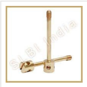
Brass Energy Meter Screw