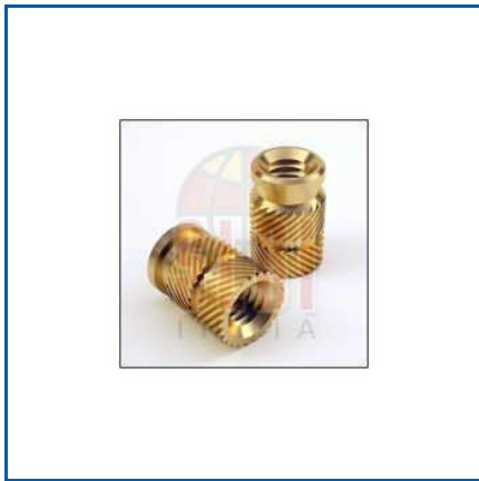
BRASS CHEVRON THREADED INSERTS