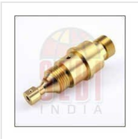
Brass Turning Fasteners