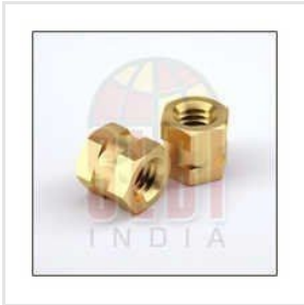
Brass Double Hex Inserts