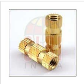
Brass Moulding Insert