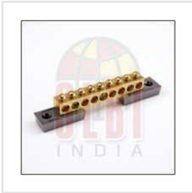
Brass Neutral Link