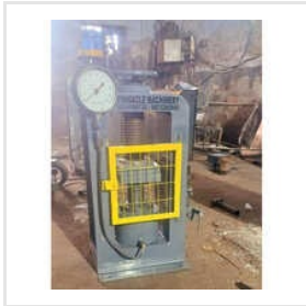
Hand Operated CTM Machine