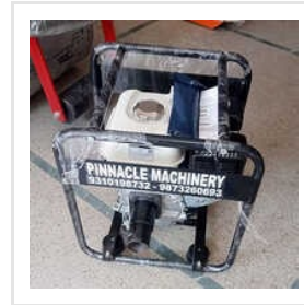
Honda Concrete Vibrator GX160