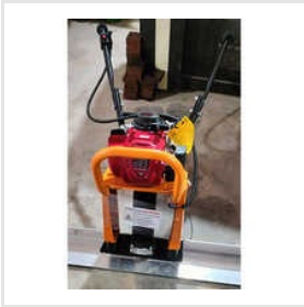
Screed Vibrator With Honda Eng GX35