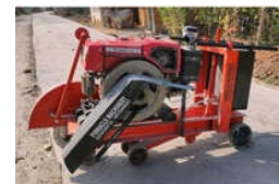
CONCRETE CUTTER WITH VST SHAKTI ENGINE