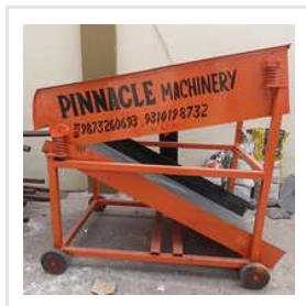
Vibratory Sand Screening Machine