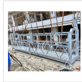
ZLP800 Suspended Rope Platform