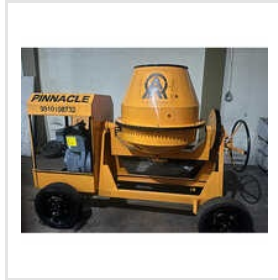
Half Bag Concrete Mixer