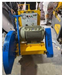
INDIAN MADE CONCRETE CUTTER WITH 30HP CG MOTOR