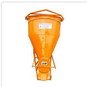
Concrete Banana Bucket