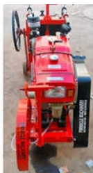
CONCRETE CUTTER WITH VST SHAKTI 13HP ENGINE

Concrete Banana Bucket, Concrete Cutter with 15HP CG Motor, Concrete Cutter with VST Shakti 13HP Engine, Concrete Cutter with VST Shakti Engine, Concrete Floor Scarifier, Concrete Power Trowel, Concrete Road Cutter with Greaves Engine, Concrete Road Paver With DG Set, Double Beam Screed Board Vibrator, Electric Tamping Rammer, FVR600 Walk Behind Double Drum Roller, Floor Polishing And Grinding Machine, Floor Polishing and Grinding Machine, GT4-14 Wire Straightening And Cutting Machine, GW52J TMT Bar Bending Machine, etc.