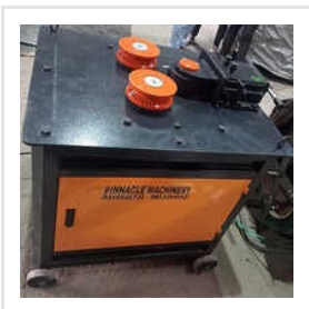
TMT Bar Spiral Bending Machine