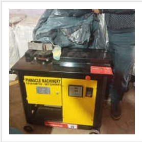
Ring Making Machine