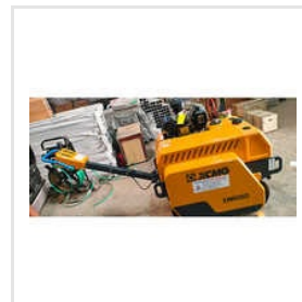
XCMG Walk Behind Roller