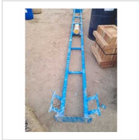
Double Beam Screed Board Vibrator