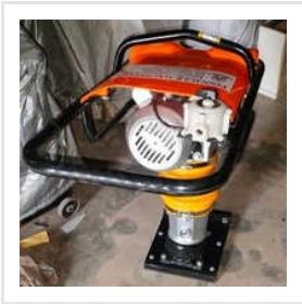
Electric Tamping Rammer