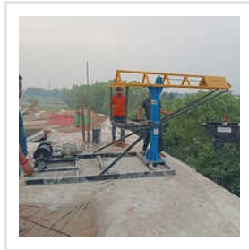
Heavy Duty Monkey Hoist