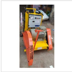
Concrete Cutter With 15HP CG Motor