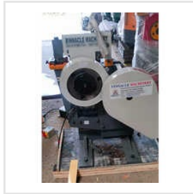
Multi Cutter Machine