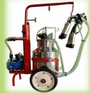
TROLLEY MILKING MACHINE