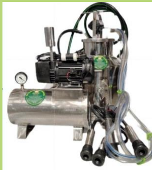
PORTABLE NANO MILKING MACHINE: