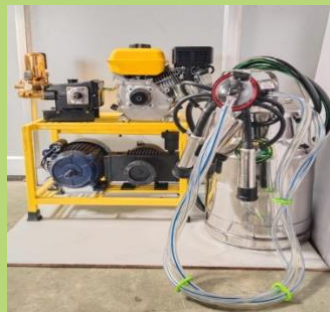
FIXED SINGLE BUCKET MILKING MACHINE WITH ENGINE/HTP (HIGH PRESSURE PUMP)