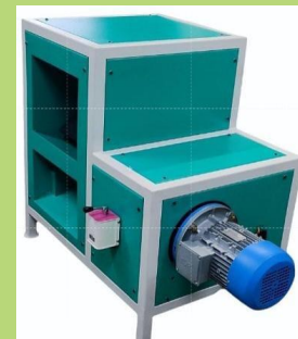
AUTOMATIC COCONUT DE-HUSKING MACHINE