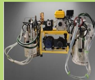
FIXED DOUBLE BUCKET MILKING MACHINE