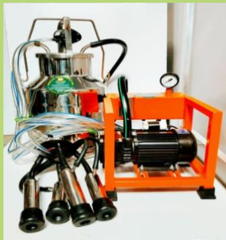
NANO MILKING MACHINE

EMAIL: srivarshandairymachines@gmail.com