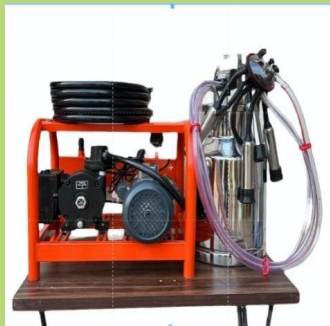
FIXED MILKING MACHINE