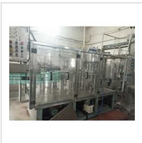
60 Bpm Mineral Water Plant