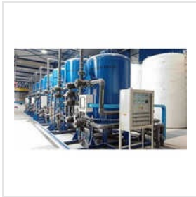
Automatic Demineralization Plant