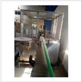
Package Drinking Water Plant