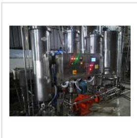
Carbonator Soft Drink Plant