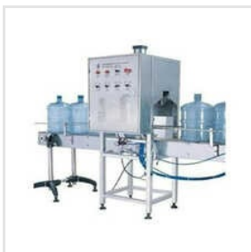
Water Packaging Plant