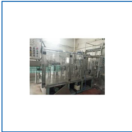
COMPLETE PACKAGE DRINKING WATER PLANT