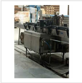
30 BPM Package Drinking Water