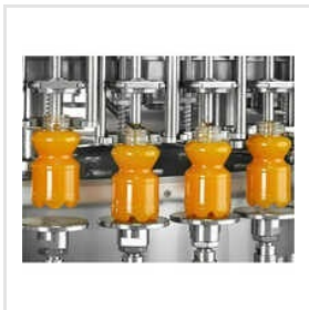
RTS Soft Drink Plant