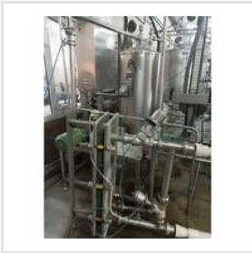
Packaged Drinking Water Plant