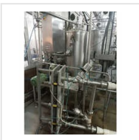
Natural Drinking Water Plant