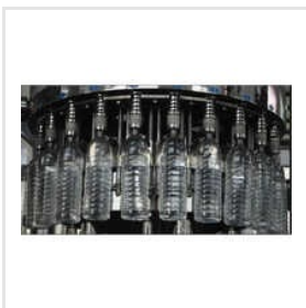
Package Drinking Water Plant