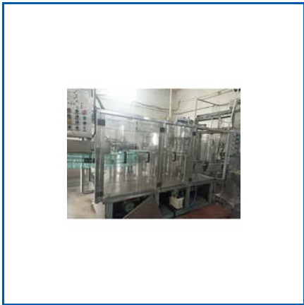
40 BPM PACKAGE DRINKING WATER PLANT

30 BPM Package Drinking Water, 30Nm PSA Oxygen Plants, 40 BPM Package Drinking Water Plant, 60 Bpm Mineral Water Plant, Aseptic Filling Machine, Automatic Bopp Labeling Machine, Automatic Bottle Rinsing Filling And Capping Machine, Automatic Carbonator Soft Drink Plant, Automatic Cup Forming Filling Machine, Automatic Demineralization Plant, etc.