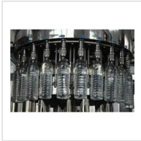
Packaged Drinking Water Plant