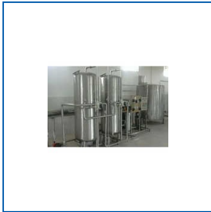
AUTOMATIC MINERAL WATER PLANT