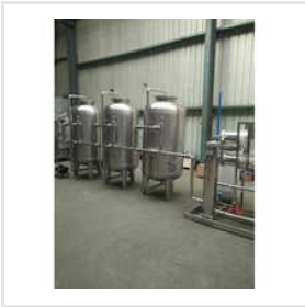
Natural Mineral Water Plant