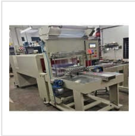
Bottle Packaging Machines