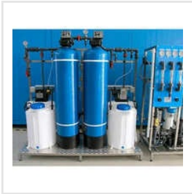
Automatic Iron Removal Filtration