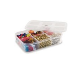
6 Partition Transparent Plastic Box