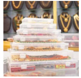
Rectangle Plastic Jewellery Box