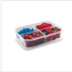
2/4 Partition Box