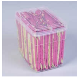
Plastic Wafer Box