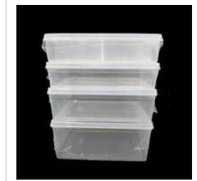
Plastic Saree Storage Boxes