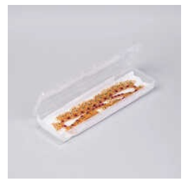
Plastic Jewelry Box