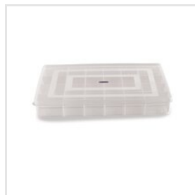
24 Partition Transparent Plastic