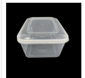
Plastic Rectangular Storage Box