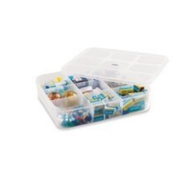
9 Partition Transparent Plastic Box