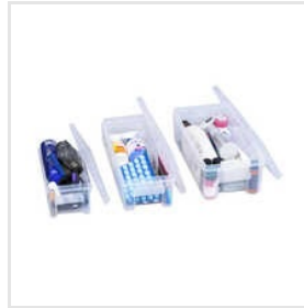
Medical/Pharmacy Shop Boxes