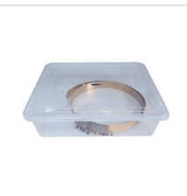
Plastic Transparent Jewelry Box