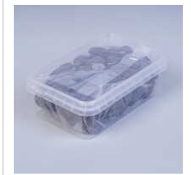
Plastic Transparent Date Box