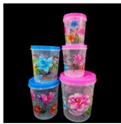
Plastic Printed Food Container