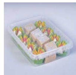
PLASTIC TRANSPARENT SWEET BOX