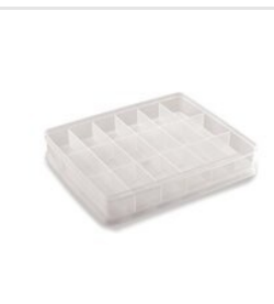
18 Partition Transparent Plastic