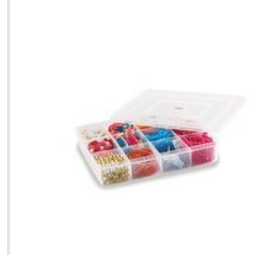
12 Partition Transparent Plastic