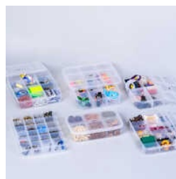
PLASTIC PARTITION STORAGE BOX