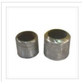
Sheet Metal Hose End Cap