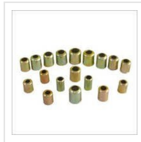
Sheet Metal Pipe End Cap