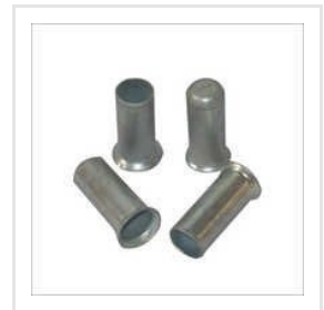
Sheet Metal Components