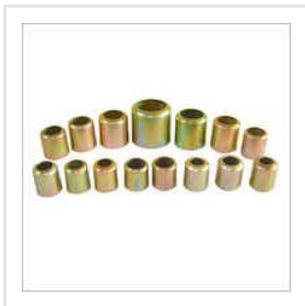
Metal Hose Caps