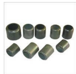
SHEET METAL CAP