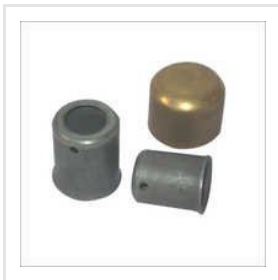
Hoses Metal End Cap