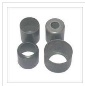
Metal Hoses Cap