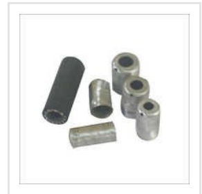
Sheet Metal Hose End Cap