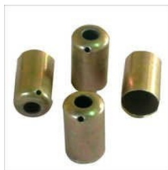
BRASS HOSES CAP