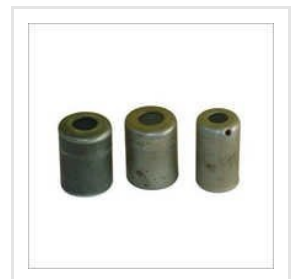
Custom Sheet Metal Cap