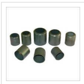
Sheet Metal End Cap