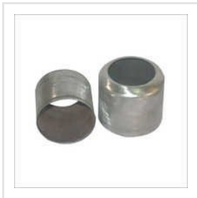
Metal Hose End Cap