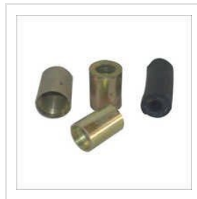
Metal End Cap