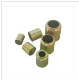
Sheet Metal Hoses End Cap