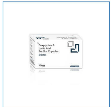
DOXYCYCLINE AND LACTIC ACID BACILLUS CAPSULES