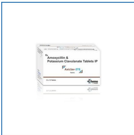
AMOXYCILLIN 250 MG + POTASSIUM CLAVULANIC 125 MG TAB IP