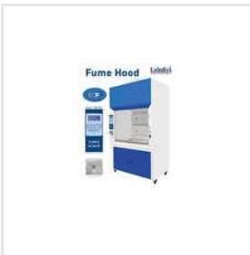
Cleanroom Fume Hood