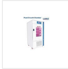
Laboratory Plant Growth Chamber