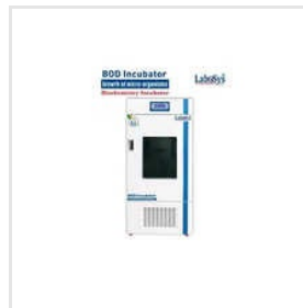
70 Degree C BOD Incubator