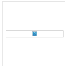
Ceiling Laminar Air Flow