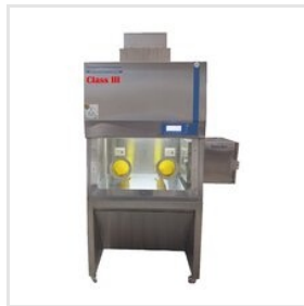
Class III Biological Safety Cabinet