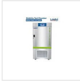
Laboratory Stability Test Chamber