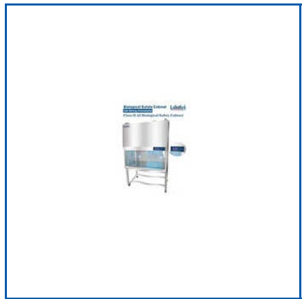
FULLY STAINLESS STEEL GMP MODEL BIOLOGICAL SAFETY CABINET