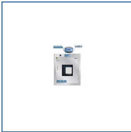
CLEANROOM STATIC PASS BOX