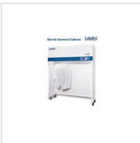
Sterile Garments Cabinet