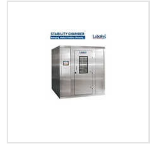
Laboratory Stability Walk In Chamber