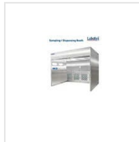
SS Sampling Booth