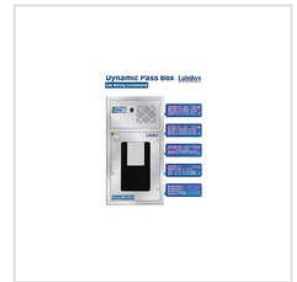
Dynamic Pass Box