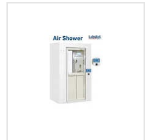
Cleanroom Air Shower