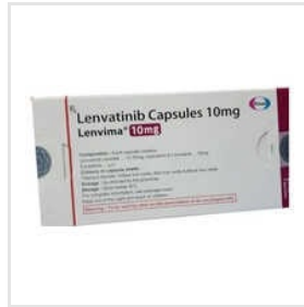
10mg Lenvatinib Capsules