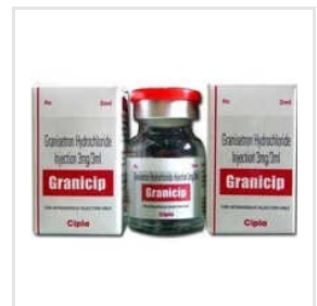
3 Mg Granisetron Hydrochloride Injection