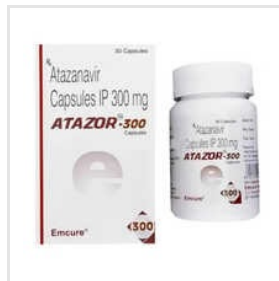
300mg Capsules IP