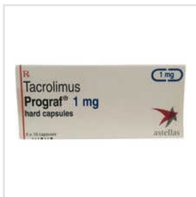
1mg Tacrolimus Hard Capsules