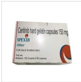
150mg Ceritinib Hard Gelatin Capsules