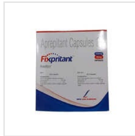
Aprepitant Capsules IP