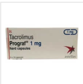
1mg Tacrolimus Hard Capsules