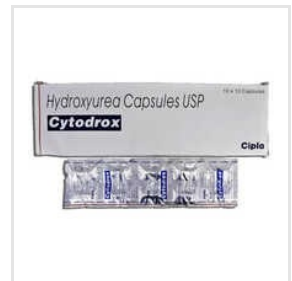
Hydroxyurea Capsules USP