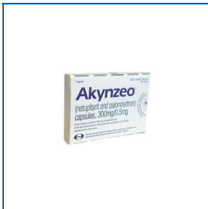
NETUPITANT AND PALONOSETRON CAPSULES

1 gm Meropenem Injection IP, 1 mg Anastrozole Tablets IP, 1 mg Arsenic Trioxide Injection, 1.5g Ascorbic Acid Injection IP, 10 mg Doxorubicin Hydrochloride Injection IP, 10 mg Mitomycin Injection IP, 10 mg Ranibizumab Solution For Injection, 100 mg Anidulafungin Injection, 100 mg Azacitidine For Injection, etc.