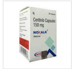
150mg Ceritinib Capsules