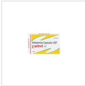
Altretamine Capsules USP