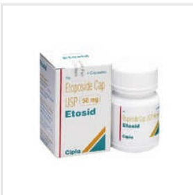
50mg Etoposide Capsule USP