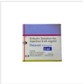
2ml Eribulin Solution For Injection