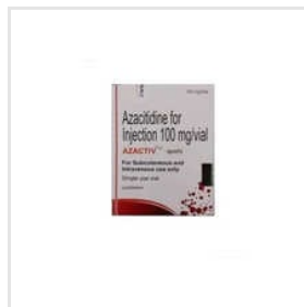
100 Mg Azacitidine For Injection