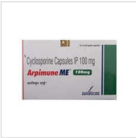
100mg Cyclosporine Capsules IP