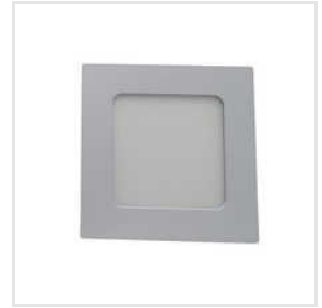
LED Square Slim Panel