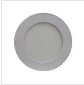
LED Round Slim Panel