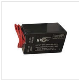
12V LED Strip Driver