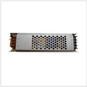
LED Power Strip Driver