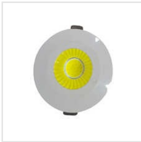
LED Round Button Light