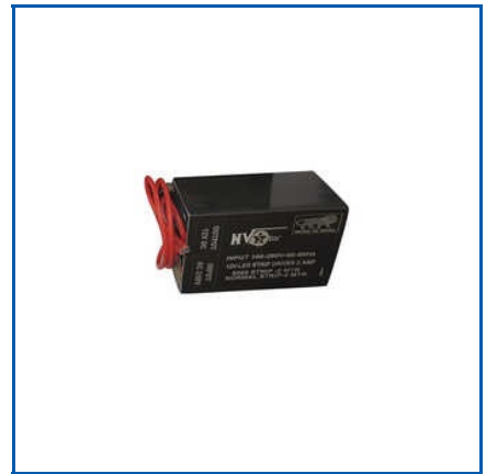
12V LED STRIP DRIVER