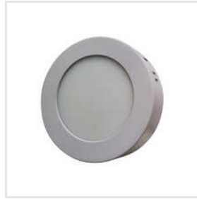
LED Round Surface Panel