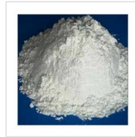
Phosphonic Acid Potassium Salt