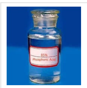
85_ Liquid Phosphoric Acid