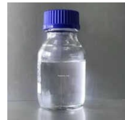
40_ POTASSIUM SALT ACTIVE PHOSPHORUS LIQUID