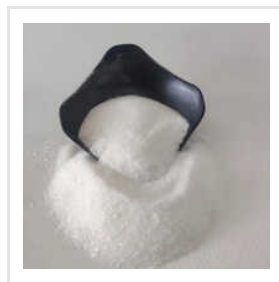
Monopotassium Phosphite- Salt Of