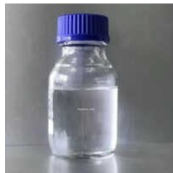
50_ POTASSIUM SALT ACTIVE PHOSPHORUS LIQUID