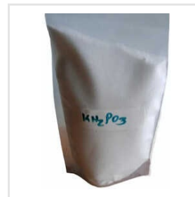
PSPA Potassium Salt Of Active Phosphorus