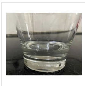
50% Potassium Phosphonate