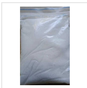
Phosphorus Acid Crystals