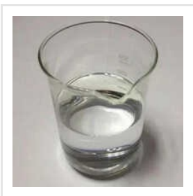
40% Potassium Phosphonate