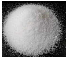
98_ POTASSIUM SALT OF ACTIVE PHOSPHORUS CRYSTALLINE POWDER

0-0-60 MOP Potassium Chloride, 0-52 -34 Monopotassium Phosphate, 0-52-34 Potassium Phosphate, 00- 00 -50 Potassium Sulphate, 12-61-0 Monoammonium Phosphate, 12-61-00 Monoammonium Phosphate, 17-44-00 Urea Phosphate, 40% Potassium Phosphonate, 40_ Potassium salt Active Phosphorus Liquid, 50 Kg Potassium Sulphate, 50% Potassium Phosphonate, 50_ Potassium Salt Active Phosphorus Liquid, 70% Liquid Phosphonic Acid, 70_ Liquid Phosphoric Acid, 7664-38-2 Phosphoric Acid, etc.