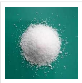
0-52-34 Potassium Phosphate