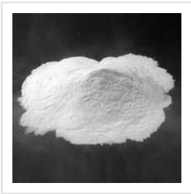
Industrial Grade Potassium