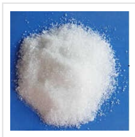
Phosphonic Acid Crystals