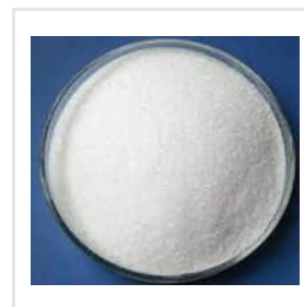
White Phosphorus Acid