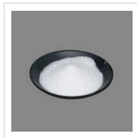
Potassium Salt Of Phosphorus Acid