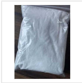
Potassium Salt Of Active Phosphonic