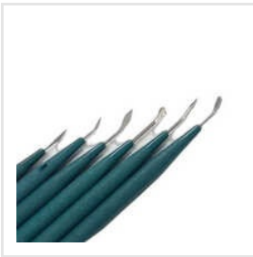
Keratome Slit Blade