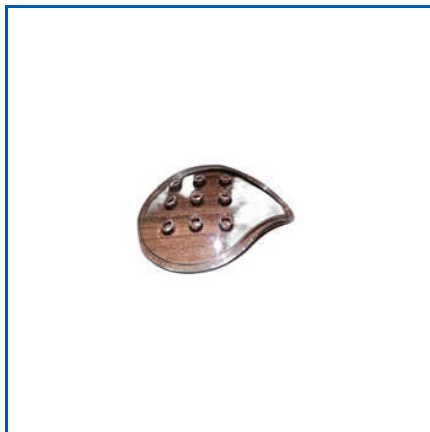
PEDIATRIC EYE SHIELD