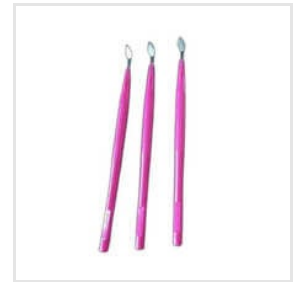
Blunt Tip Enlargent Round Blades