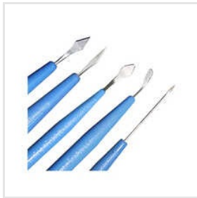
15 Degree Sideport