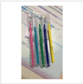
Mvr 20G Ophthalmic Micro Surgical Knife