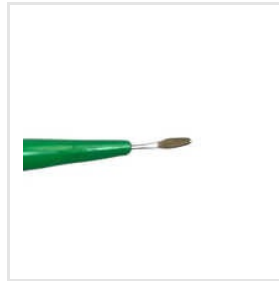
Crescent Ophthalmic Micro Surgical Knife