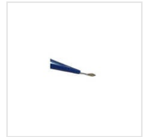
Keratome Slit 2.2 Mm Double Bevel