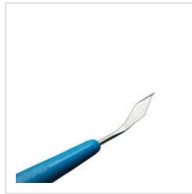
Mvr 23G Ophthalmic Micro Surgical Knife