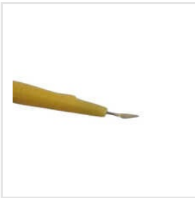
Lance Tip Knives