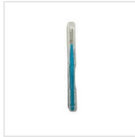
Mvr 20G Ophthalmic Micro Surgical Blade