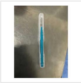
Mvr 19G Ophthalmic Micro Surgical Blade