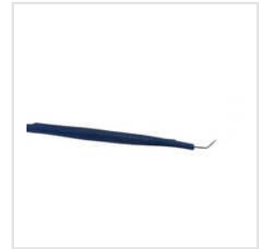
Keratome Slit 2.4 Mm Double Bevel