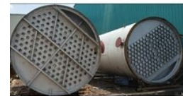
INDUSTRIAL DISTILLATION COLUMNS