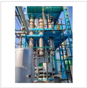
Comercial Site Drafting Service