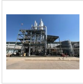
Zero Liquid Discharge