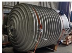
LIMPET COIL REACTOR