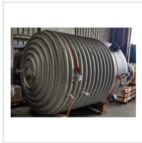
Limpet Coil Reactor