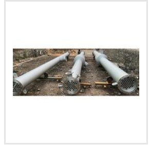
Tube Heat Exchanger