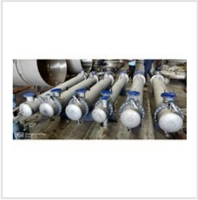
U - Tube Heat Exchanger