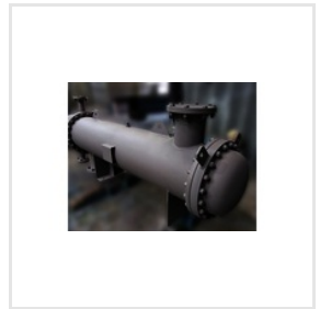
Shell & Tube Type Heat Exchanger