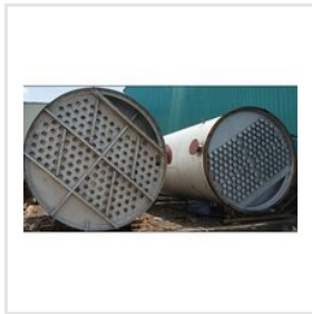
Industrial Distillation Columns