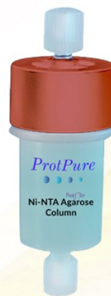
NI-NTA AGAROSE COLUMN

Activated/Crosslinked 2% Agarose Resins For Size Exclusion Or Molecular Sieving, Activated/Crosslinked 4% Agarose Resins For Size Exclusion Or Molecular Sieving, Activated/Crosslinked 6% Agarose Resins For Size Exclusion Or Molecular Sieving, CM Agarose Carboxymethyl Agarose - Weak Cation Exchanger Resins, CNBR Activated Agarose Resins, etc.