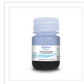
Magnetic Nanoparticles For DNA