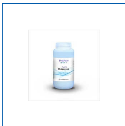
Q AGAROSE QUATERNARY AMINE AGAROSE - STRONG ANION EXCHANGER