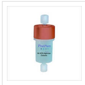
Ni-NTA Agarose Column