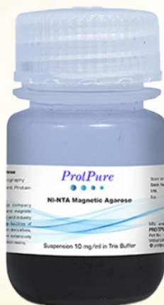
NI-NTA MAGNETIC AGAROSE