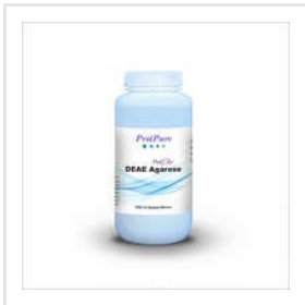
DEAE Agarose Diethylaminoethyl