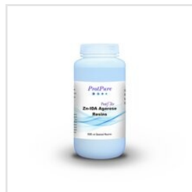
Zn-IDA Agarose Resins