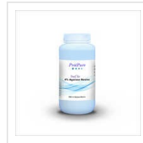
Plain/ Standard/ Basic 4% Agarose Resins For