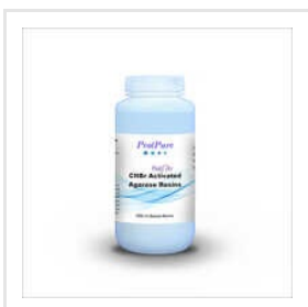
CNBR Activated Agarose Resins