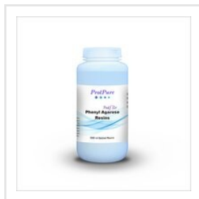
Phenyl Agarose Resins