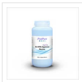
Zn-NTA Agarose Resins