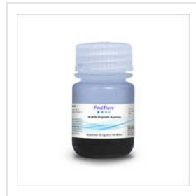
Ni-NTA Magnetic Agarose