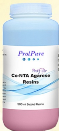
CO-NTA AGAROSE RESINS