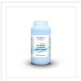
Activated/Crosslinked 4% Agarose Resins For