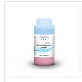
Co-NTA Agarose Resins