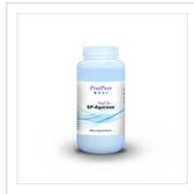
SP Agarose: Sulfopropyl Agarose