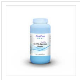
Ni-NTA Agarose Resins