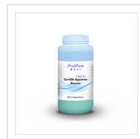
Cu-IDA Agarose Resins