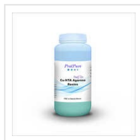
Cu-NTA Agarose Resins