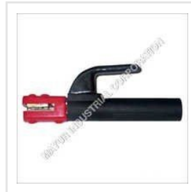
WELDING HOLDER WELDOWIN KD-1000