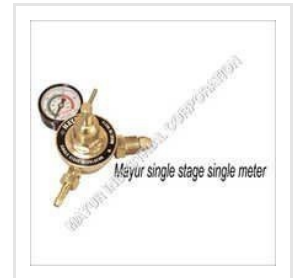
Mayur Single Stage Regulator