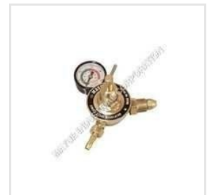
Single Stage Regulator