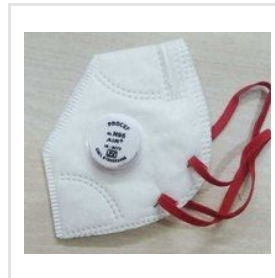
Procef N95 Face Mask With Valve