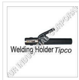
Welding Holder Tipco