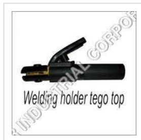
Welding Holder Tego Top