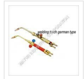
Welding Torch German Type