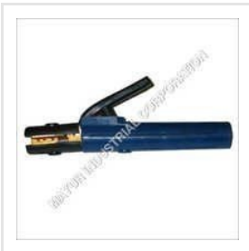
WELDING HOLDER WELDOWIN SONA