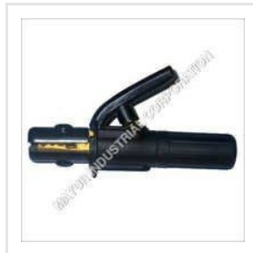
WELDING HOLDER TEGO CT -500