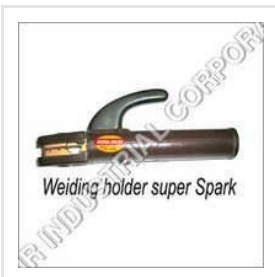
Welding Holder Super Spark