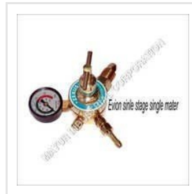
Evion Single Stage Regulator