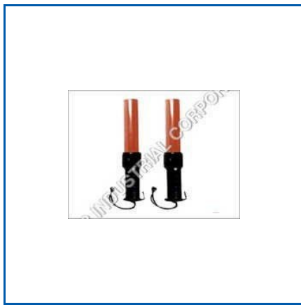
SIGNAL LIGHT BATONS