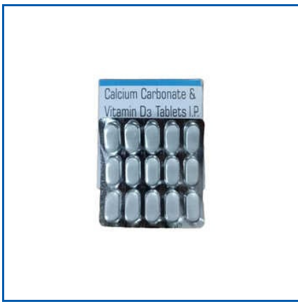
BIOCAL D3 CALCIUM CARBONATE TABLET

1.5 gm Cefoperazone Sulbactam Injection, 1.5 gm Ceftriaxone and Sulbactam For Injection, 100 mg Itraconazole Capsule, 100 ml Ambroxol Hydrochloride Guaphenesi Terbutaline Sulphate And Menthol Syrup, 100ml Dextromethrphan Hydrochloride Syrup, 15 gm Beclomethasone Dipropionte Clotrimazole And Neomycin Sulphate Cream, etc.