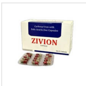
Carbonyl Iron With Folic Acid And Zinc