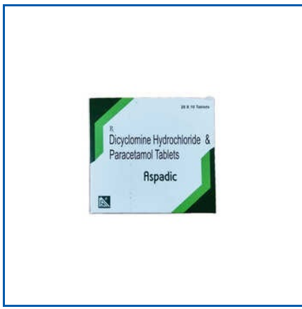
DICYCLOMINE HYDROCHLORIDE PARACETAMOL TABLET