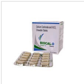
Calcium Carbonate And Vitamin D3