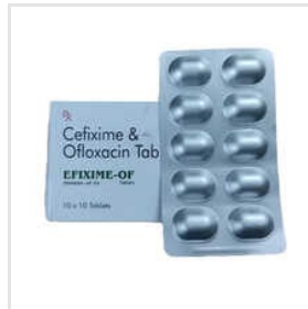
Cefixime Ofloxacin Tablet