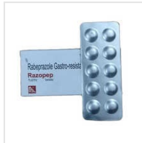
Rabeprazole Gastro Resistant Tablet