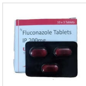
200 Mg Fluconazole Tablet