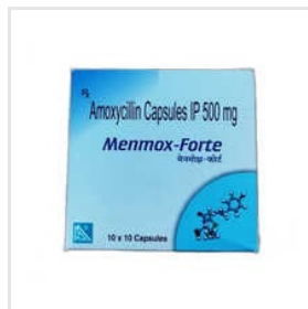
500 Mg Mennox Forte Amoxicillin Capsule