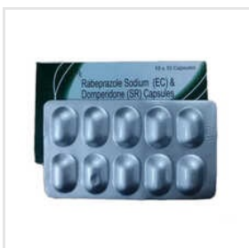
Rabeprazole Sodium Domperidone