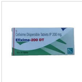
Cefixime Dispersible Tablet