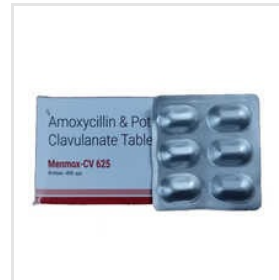
Amoxicillin Potassium Clavulanate Tablet