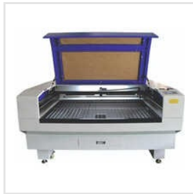
Single Phase CO2 Laser Cutting Machine