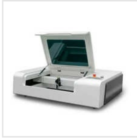
Mini CO2 Laser Cutting Machine