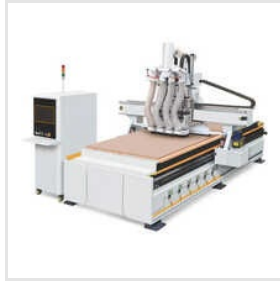
CNC Wood Router Machine