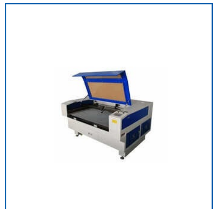
CO2 LASER CUTTING MACHINE