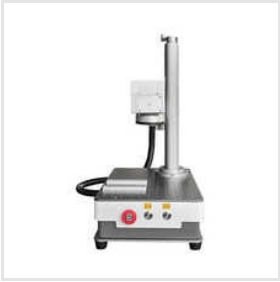
Mini Fiber Laser Marking Machine