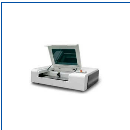
MINI CO2 LASER CUTTING MACHINE

CNC Wood Router Machine, CO2 Laser Acrylic Cutting Machine, CO2 Laser Cutting Machine, CO2 Laser Focus Lens, CO2 Laser Machine Reflection Mirror, Fiber Laser Marking Machine, Glass Laser Engraving Machines, Industrial Co2 Laser Cutting Machine, Mini CO2 Laser Cutting Machine, Mini Fiber Laser Marking Machine, Single Phase CO2 Laser Cutting Machine, etc.