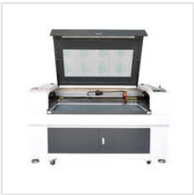
CO2 Laser Acrylic Cutting Machine