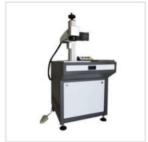
Fiber Laser Marking Machine