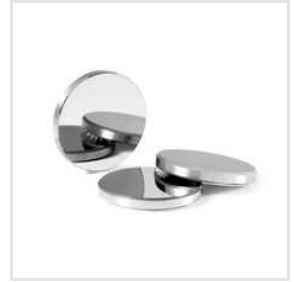
CO2 Laser Machine Reflection Mirror