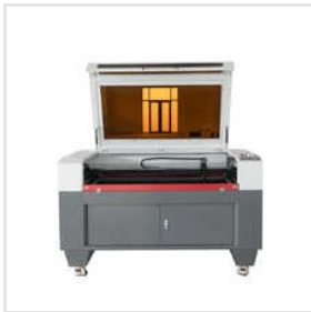
Glass Laser Engraving Machines