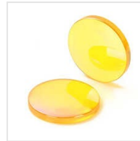
CO2 Laser Focus Lens