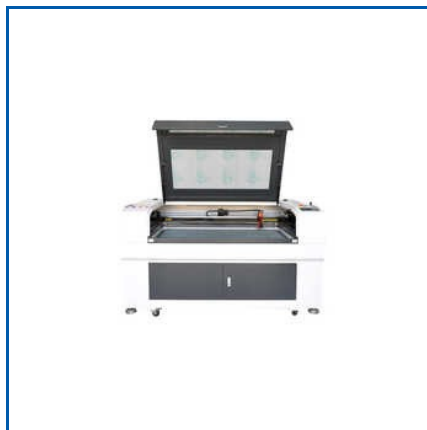
CO2 LASER ACRYLIC CUTTING MACHINE