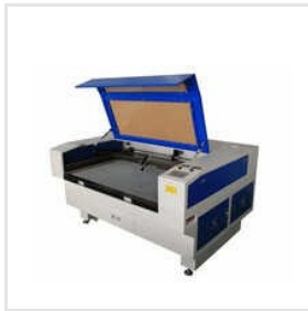
CO2 Laser Cutting Machine