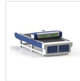
Industrial Co2 Laser Cutting Machine