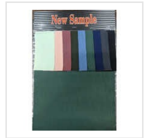
Popcorn T Shirt Fabric