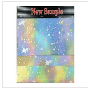
Snowfall Print Lycra Fabric