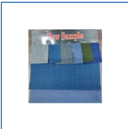
ZURIC MELANGE LYCRA FABRIC

2 Way Semi Zurich Lycra Fabric, Barcode Rib Fabric, Crush Checks Fabric, Fitbit Patta Fabric, Full Dull Polyester T Shirt Fabric, Full Dull T Shirt Fabric, Grey Dry Fit Fabric, Karara Knitted Fabric, Linear Lower Lycra Fabric, Loop Knit Fabric, Looper Knitted Fabrics, Lycra Military Fabric, Lycra Rib Fabric, Lycra T Shirt Fabric, Melange Polyester Lycra Fabric, etc.