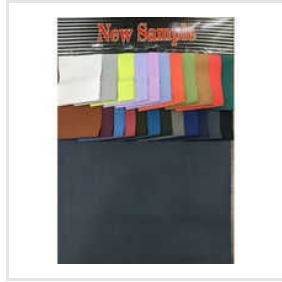
Taiwan 4 Way Lycra Fabric