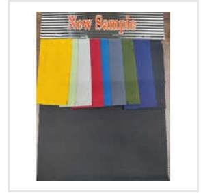
2 Way Semi Zurich Lycra Fabric