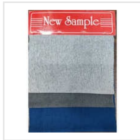
Melange Polyester Lycra Fabric