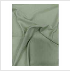
Snowfall Crush Lycra Fabric