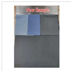
Looper Knitted Fabrics