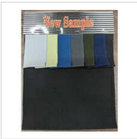
Karara Knitted Fabric