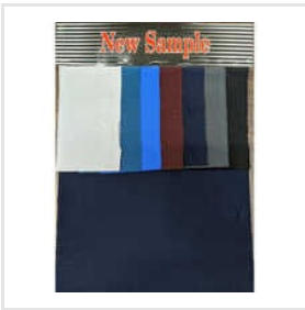
Pin Mesh T Shirt Fabric