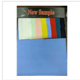
Reebok Knit Fabric