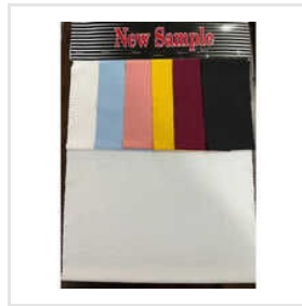
Lycra Rib Fabric