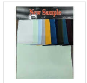
Lycra T Shirt Fabric