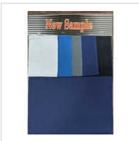
Full Dull Polyester T Shirt Fabric