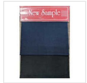
Twill Lycra Fabric