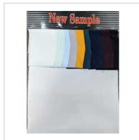
Full Dull T Shirt Fabric