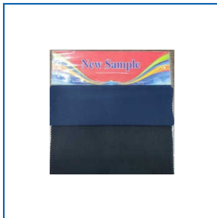
VALENTINO LYCRA FABRICS