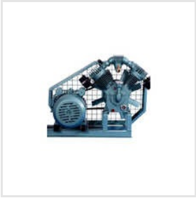
Pumps And Compressors