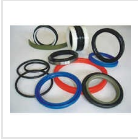
Seals And O-Rings