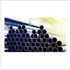
Tubular And Structural Products