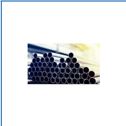
TUBULAR AND STRUCTURAL PRODUCTS

Activated Carbon, Industrial Chemicals, Microcrystalline Wax, Pumps And Compressors, Seals And O-Rings, Steel Bolting, Steel Flanges, Steel Gaskets, Steel Round Pipe, Tubular And Structural Products, etc.