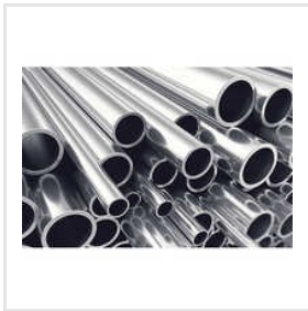
Steel Round Pipe