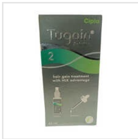
60ml Hair Gain Treatment Spray