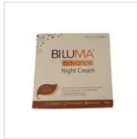
Biluma 45g Advance Night Cream