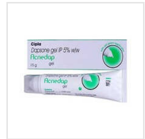
15g Dapsone 5% W-W Gel IP