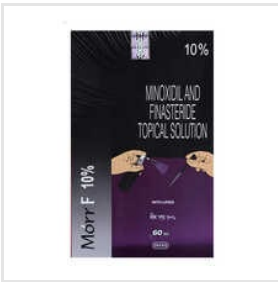
60ml Minoxidil And Finasteride Topical