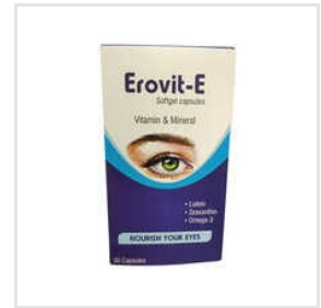
Vitamin And Mineral Softgel Capsules