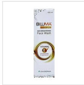
Biluma 100ml Advance Face Wash