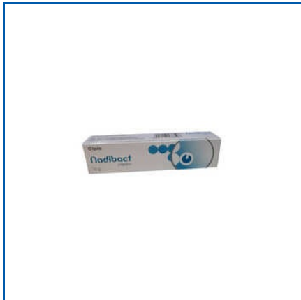
10G NADIBACT CREAM