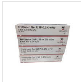
20g Tretinoin 0.1% W-W Gel USP