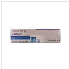
15g Adapalene Gel