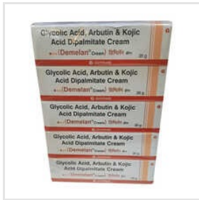
20g Glycolic Acid Arbutin And Kojic Acid