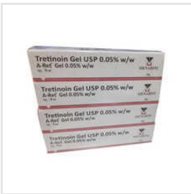
20g Tretinoin 0.05% W-W Gel USP