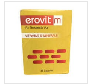
Vitamins And Minerals Capsules