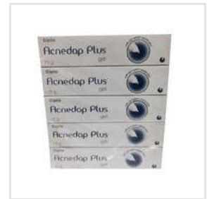
15g Acnedap Plus Gel