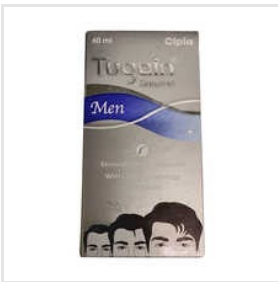
60ml Hair Regrowth Treatment Solution For