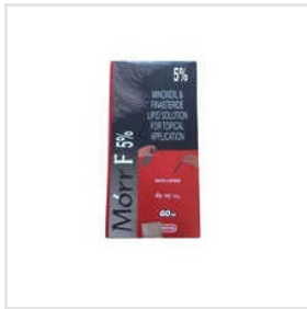
60ml Minoxidil And Finasteride Lipid