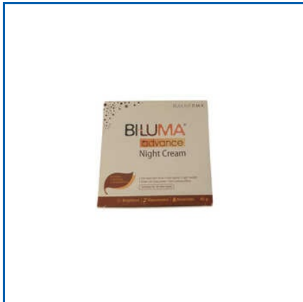
BILUMA 45G ADVANCE NIGHT CREAM