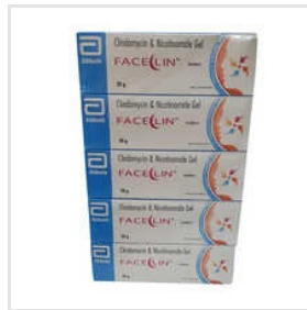
20g Clindamycin And Nicotinamide Gel