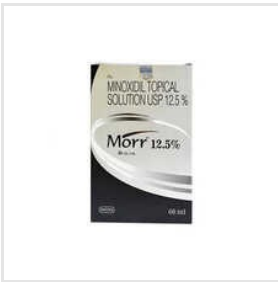
60ml Minoxidil Topical Solution 12.5% USP