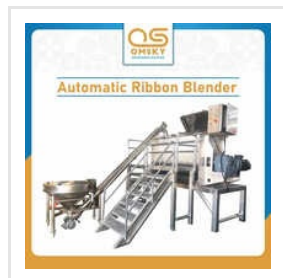
Automatic Ribbon Blender