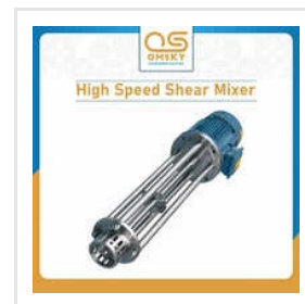
High Speed Shear Mixer