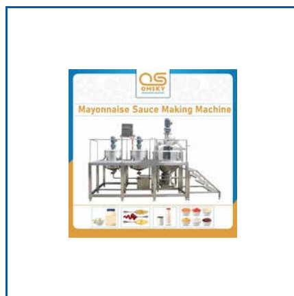
MAYONNAISE SAUCE MAKING MACHINE