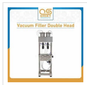
Commercial Vacuum Filler 2 Head For Glass