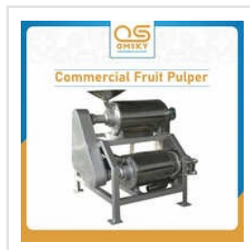
Coffee Baby Pulper Machine