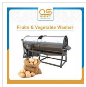
Fruit And Vegetable Drum Washer