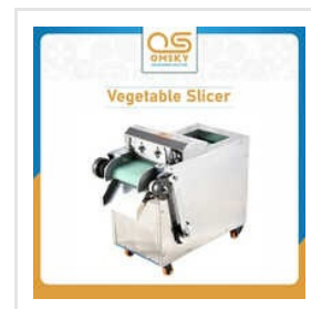
Industrial Vegetable Chopper