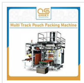
5 HP Multi Track Pouch Packing Machine