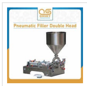
Double Piston Filler Head