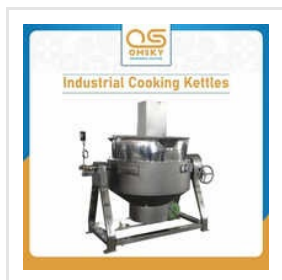
Industrial Cooking Kettles