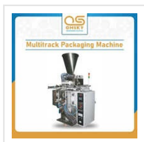
Automatic Multitrack Packaging Machine