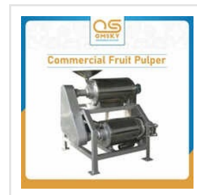
240 V Semi Automatic Fruit Pulper