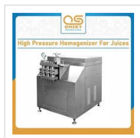
High Pressure Homogenizer For Juice