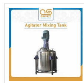
Agitator Mixing Tank