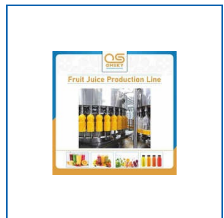
FRUIT JUICE PRODUCTION LINE