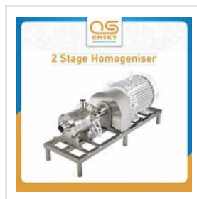
2 Stage Homogeniser