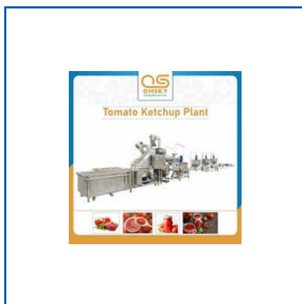
TOMATO SAUCE MAKING PLANT

2 Stage Homogeniser, 2 Stage Homogenizer, 220 V 1 ADS Seamer, 220 V Can Reformer Machine, 220 V Tomato Ketchup Plant, 24 Ds Seamer Machine, 240 V Lug Cap Sealer Machine, 240 V Semi Automatic Fruit Pulper, 440 V Can Body Bearer Machine, 440 V Soybean Milk Machine, 5 HP Multi Track Pouch Packing Machine, Agitator Mixing Tank, Automatic Canning Retort Machine, Automatic Juice Pasteurizer, Automatic Multitrack Packaging Machine, etc.