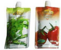
Poly Stand Up Pouches