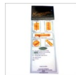
Hardware Electronic Packaging Pouch