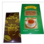
Tea And Coffee Packaging Pouch