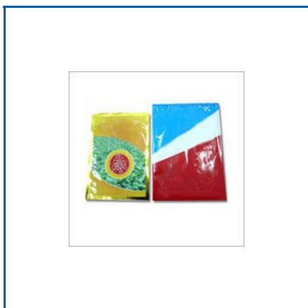
SEEDS PACKAGING PRINTED POUCHES

Aluminium Foil, Aluminium Foil Bags, Aluminium Foil Standing Pouch, Aluminum Foil Pouch, Aluminum Foil Ziplock Pouch, Alumnium Foil Pouches, Animal Food Packaging Pouch, Animal Food Packaging Spout Pouch, Bopp Pouches, Band Sealer, Colored Stand Up Spout Pouch, Food Packaging Aluminum Foil Pouch, Food Packaging Pouch, Foot Pedal Heat Sealing Machine, Foot Sealer, Etc.