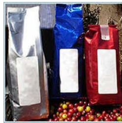
Tea - Coffee Packaging Material