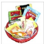
Food Packaging Pouch