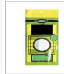
Hardware Electronic Packaging Pouches