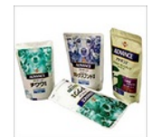
Animal Food Packaging Pouch