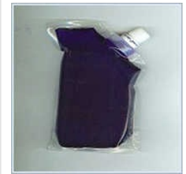
Lubricant Packaging Pouches