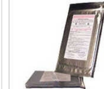
Alumnium Foil Pouches