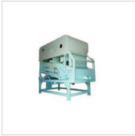
Seed Cleaning And Grading Machine