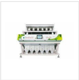
Grain Color Sorting Machine