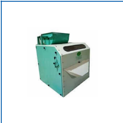
AUTOMATIC MAGNETIC DESTONER MACHINE

5 TPH Seed Cleaning Machine, Automatic Gravity Separator Machine, Automatic Magnetic Destoner Machine, Color Sorting Machine, Colour Sorte Machine, Double Destoner Machine, Electric Gravity Separator Machine, etc.