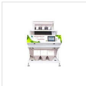
Rice Color Sorter Machine