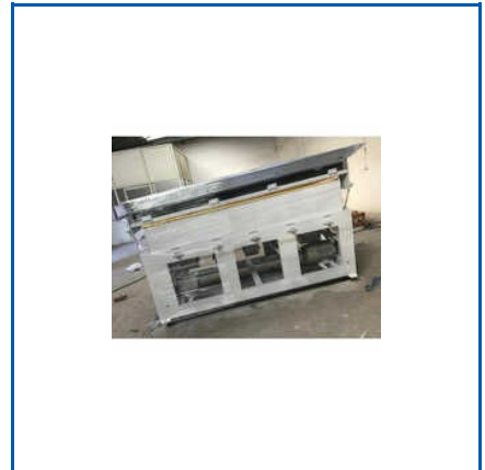
VIBRO DESTONER MACHINE