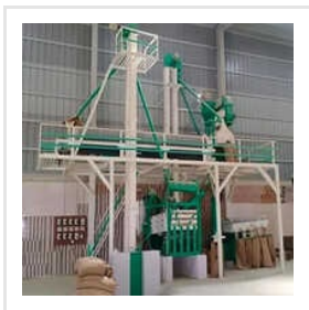
Electric Gravity Separator Machine