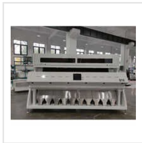
Color Sorting Machine