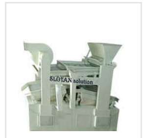
Rice Cleaning Machine