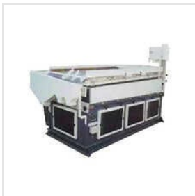
Industrial Gravity Separator Machine