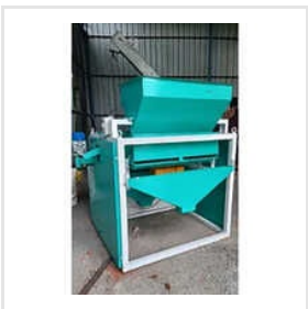
Automatic Magnetic Destoner Machine