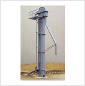
Seed Cleaning Machines