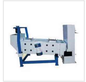
Seeds Clean Mtr Machine