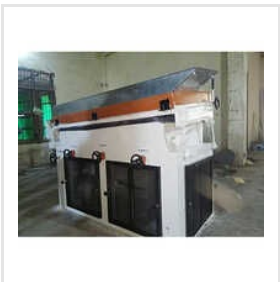
Automatic Gravity Separator Machine