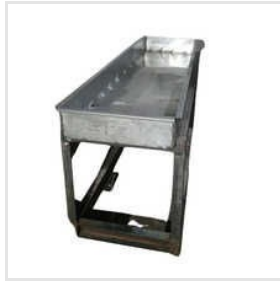
5 TPH Seed Cleaning Machine