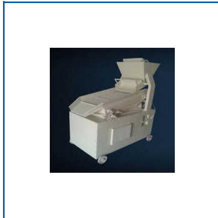
VACUUM DESTONER MACHINE