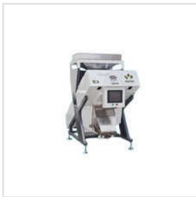
Colour Sorte Machine