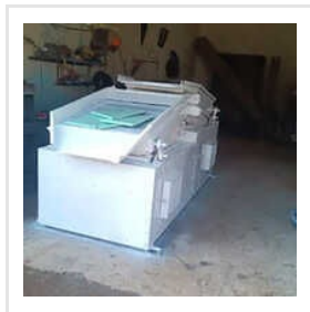
Double Destoner Machine