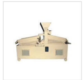
Food Grain Cleaning Plant