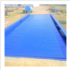
Electronic Pit Weighbridge