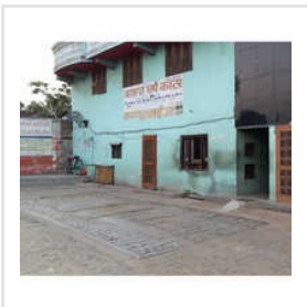
Industrial Electronic Weighbridge