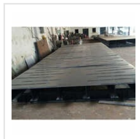
Electronic Weighbridge Terminal