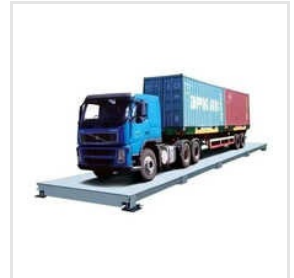
Mild Steel Heavy-Duty Industrial Electronic Weighbridge