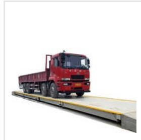
Steel Electronic Pitless Weighbridge