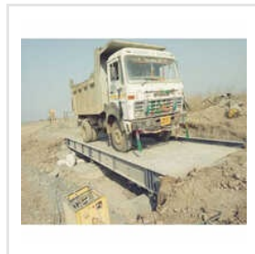
Iron Electronic Weighbridge