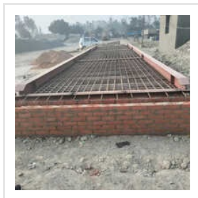
Mild Steel 150 Tonnes Electronic Weighbridge