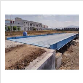
Electronic Computerized Weighbridge