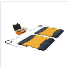
Electronic Portable Weighbridge