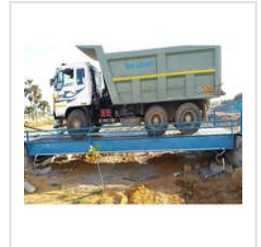
Electronic Iron Truck Weighbridge