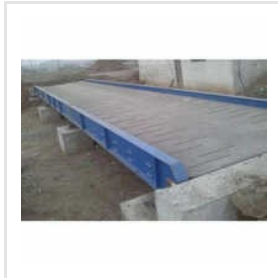
Pitless Electronic Weighbridge