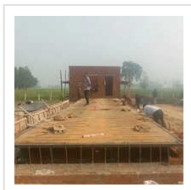
Computerized Electronic Weighbridge