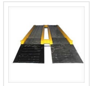
Heavy Duty Truck Weighbridge