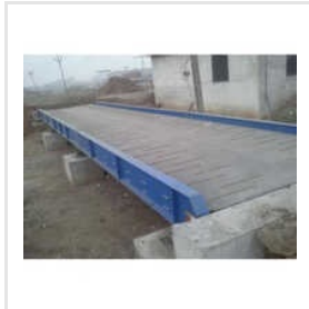
200 Ton Electronic Pitless Weighbridge