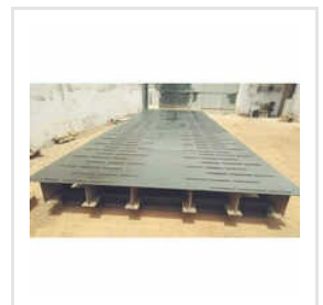
Mild Steel Electronic Weighbridge