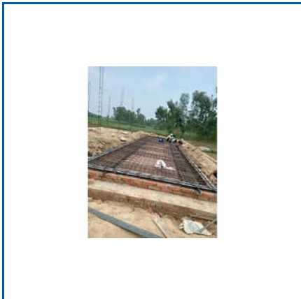
BUILT ON-SITE CONCRETE PLATFORM WEIGHBRIDGE