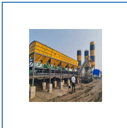
STATIONARY INLINE CONCRETE BATCHING PLANTS