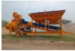
Mobile Concrete Batching Plant