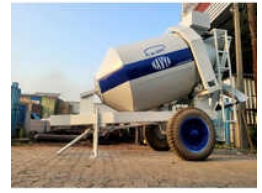
Tractor Operated Concrete Transit Mixer