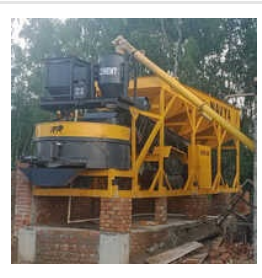
Pan Mixer Concrete Batching Plants