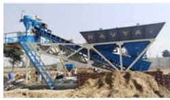
Compact Concrete Batching Plant With