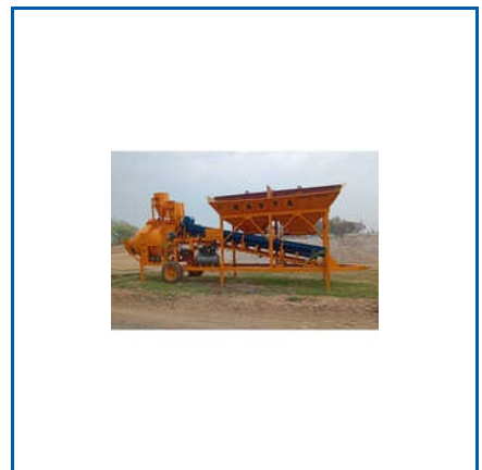
MOBILE CONCRETE BATCHING PLANT