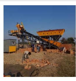
Compact Concrete Batching Plant