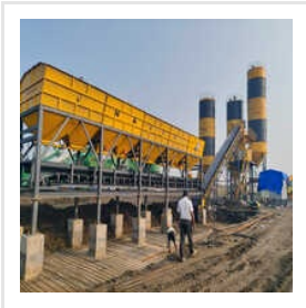
Stationary Inline Concrete Batching