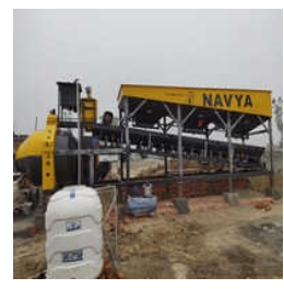
Drum Mixer Concrete Batching Plants