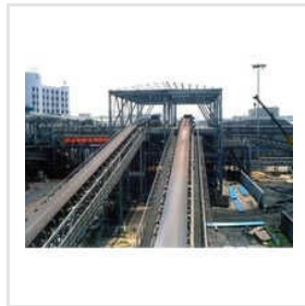
Coal Conveyor Belt System