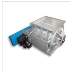
Rotary Airlock Feeder