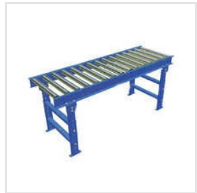
Driven Roller Conveyors