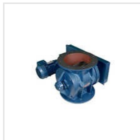
Industrial Rotary Airlock Valve