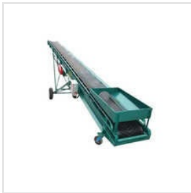
Portable Belt Conveyor System