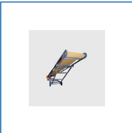
MS BAG STACKERS CONVEYORS

100 Ton Sugar Handling System, 100 kW Jumbo Bag Filling Machine, 1000 LPH Automatic Dosing Pump Machine, 2 Ton Bucket Elevator, 220V Stainless Steel Screw Conveyor, 50 Ton Grain Storage Silo, 80mm Belt Conveyor Head Pulley, Automated Weighing System, Bag Handling Conveyor System, Coal Conveyor Belt System, Conventional Steel Building Structure Work Services, Driven Roller Conveyors, Flat Belt Conveyor, Flat Chain Conveyor, Heavy Duty Belt Conveyor, etc.