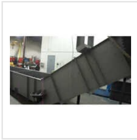
Submerged Ash Conveyor