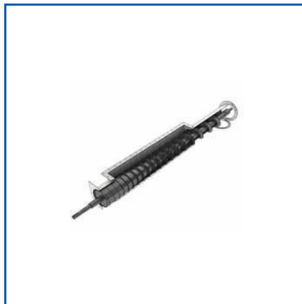
INDUSTRIAL SCREW FEEDER