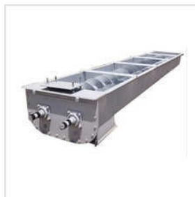
MS Twin Screw Conveyor