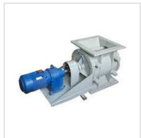
MS Rotary Airlock Valve