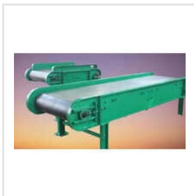
Flat Belt Conveyor