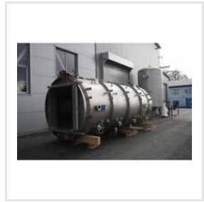
Mild Steel Tank Fabrication Services