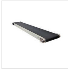
Heavy Duty Belt Conveyor