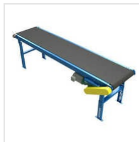
Industrial Inclined Belt Conveyor