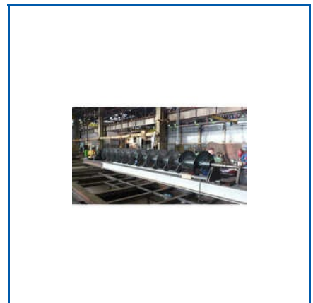
SCREW CONVEYING SYSTEM