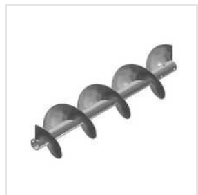
220V Stainless Steel Screw Conveyor