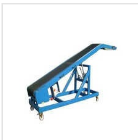
Lorry Loader Conveyor