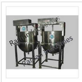
Fix Kettle With Scraper