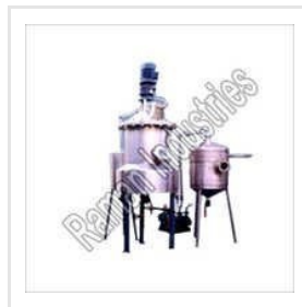
Vacuum Evaporated Kettle