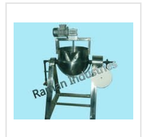
Steam Jacketed Kettle Tilting Type With