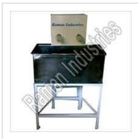
Bottle Washing Machine