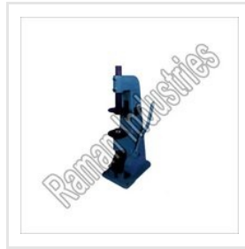
Round Can Flanger