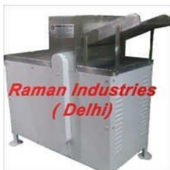
ALOE VERA GEL EXTRACTION MACHINE

Aloe Vera Gel Extraction Machine, Apple Corer And Slicer Machine, Automatic Ginger Paste Making Machine, Automatic Hydraulic Juice Press, Automatic Hydro Machine, Automatic Paste Making Machine, Bottle Washing Machine, Bubble Washer, Can Body Beader, Canning Retort, Colloidal Mill, Crown Corking Machine Pedal Model, Double Mango Pulper, Double Seamer 1 ADS, Electric Fruit Juicer, etc.