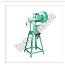
Double Seamer 1 ADS