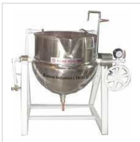
Steam Jacketed Kettle