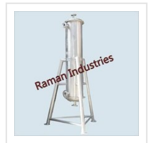
Vertical Pasteuriser Heat Exchanger