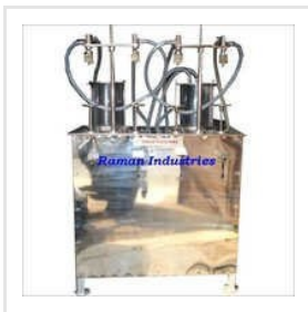
Vacuum Filling Machine