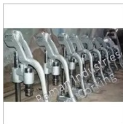
HEAVY DUTY CROWN CORKING MACHINE