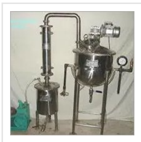
Flash Evaporator Vacuum Pan