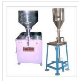
Paste Cream Tube Filling Machine