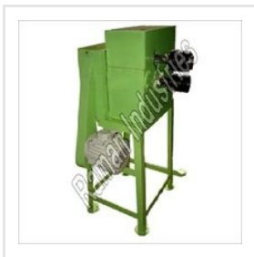
Can Body Beader