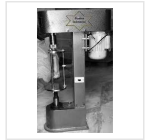
Pet Bottle Capping Machine