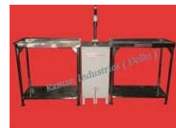
CROWN CORKING MACHINE PEDAL MODEL