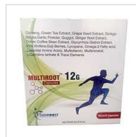
Ginseng Green Tea Extract Multivitamin