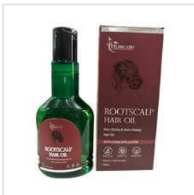
Non Stricky And Non Greasy Hair Oil