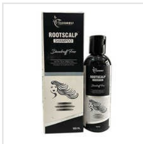
Dandruff Free Shampoo With Tea