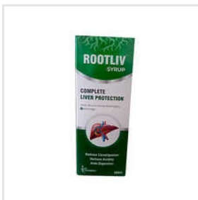
200 ML Liver Protection Syrup