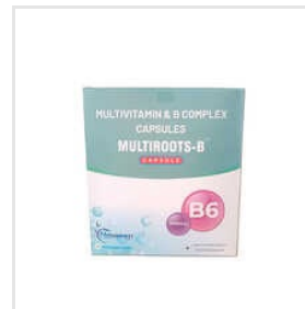
Multivitamin And B Complex Capsules