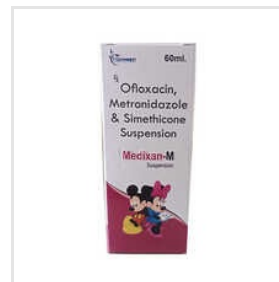
60 ML Ofloxacin Metronidazole And