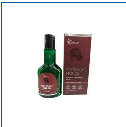
NON STRICKY AND NON GREASY HAIR OIL