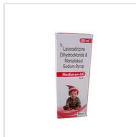
Levocetirizine Dihydrochloride And