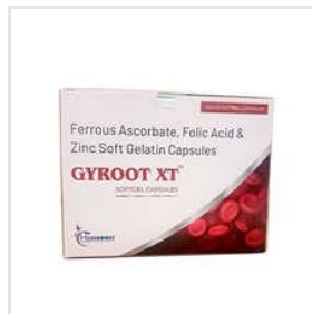
Ferrous Ascorbate Folic Acid And Zinc Soft