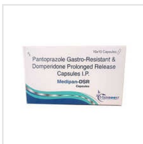
Pantoprazole Gastro-Resistant And