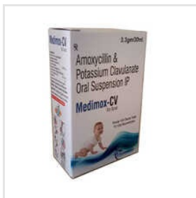
Amoxicillin And Potassium