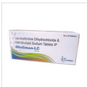
Levocetirizine Dihydrochloride And