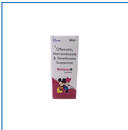
60 ML OFLOXACIN METRONIDAZOLE AND SIMETHICONE SUSPENSION

200 ml Liver Protection Syrup, 200ml Calcium Vitamin D3 K27 Magnesium Vitamin C and Zinc Syrup, 60 ml Mefenamic Acid And Paracetamol Oral Suspension, 60 ml Ofloxacin Metronidazole and Simethicone Suspension, Aceclofenac Paracetamol and Serratiopeptidase Tablet, Amoxicillin and Potassium Clavulanate Oral Suspension I.P, Calcium Malate Zinc Magnesium Vitamin K27 And Vitamin D3 Tablets, Dandruff Free Shampoo With Tea Tree Oil, Ferrous Ascorbate Folic Acid and Zinc Soft Gelatin Capsules