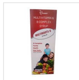
Multivitamin And B Complex Syrup