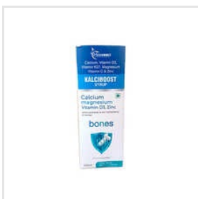
200ml Calcium Vitamin D3 K27