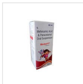
60 ML Mefenamic Acid And Paracetamol Oral