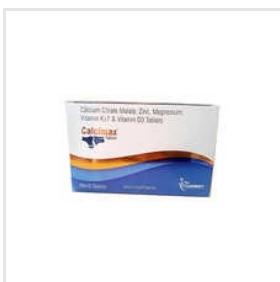
Calcium Malate Zinc Magnesium Vitamin