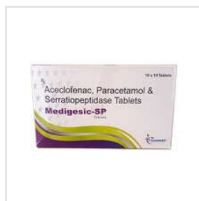
Aceclofenac Paracetamol And