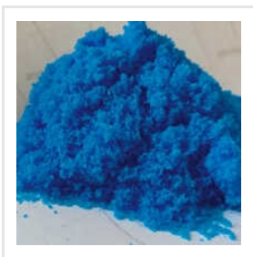
Copper II Sulphate