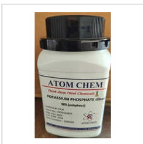
Potassium Phosphate Dibasic