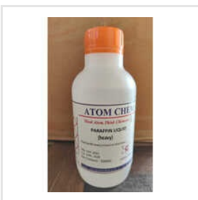
Paraffin Liquid Heavy