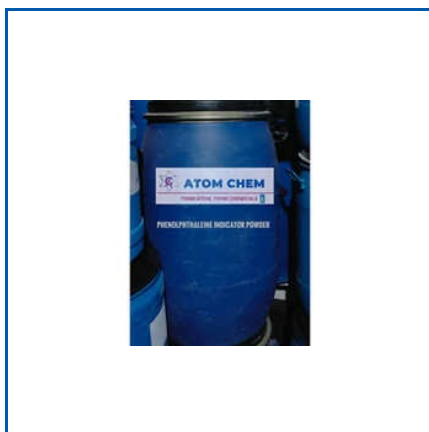
PHENOLPHTHALEIN INDICATOR POWDER