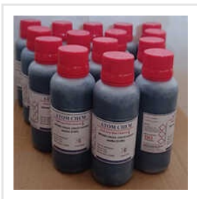
Bromocresol Green Indicator Solution