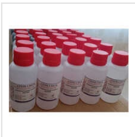
Phenolphthalein Indicator Solution