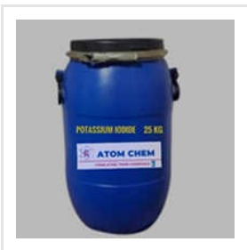
Potassium Iodide Powder