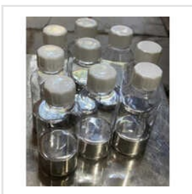
Silver Liquid Mercury