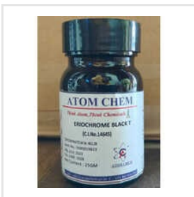
Eriochrome Black T