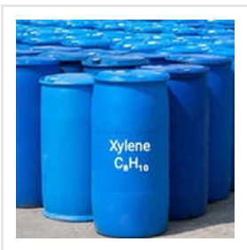
Xylene Chemical C_8H_{10}