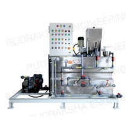
Polymer Dosing System