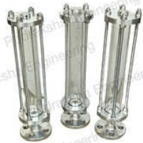
STAINLESS STEEL CALIBRATION POTS

01_ Worm Type Chemical Agitator, 02_ Worm Type Chemical Agitator, Auto Polymer Dosing System, Bladder Type Pulsation Dampener, Chlorine Dosing System, Inline Helical Agitator, Lp Hp Dosing System, Mechanical Diaphragm Pump, Polymer Dosing System, Stainless Steel Calibration Pots, Static Mixer For Chemical Industry, etc.