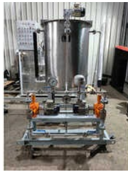
Lp Hp Dosing System