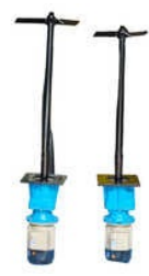
Inline Helical Agitator