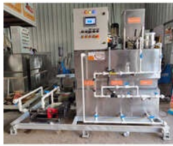
Auto Polymer Dosing System