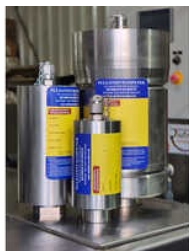
Bladder Type Pulsation Dampener