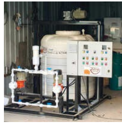
Chlorine Dosing System