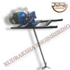
01_ WORM TYPE CHEMICAL AGITATOR