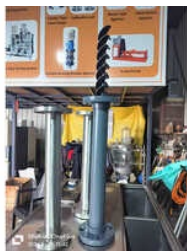
Static Mixer For Chemical Industry