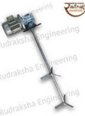
02_ WORM TYPE CHEMICAL AGITATOR