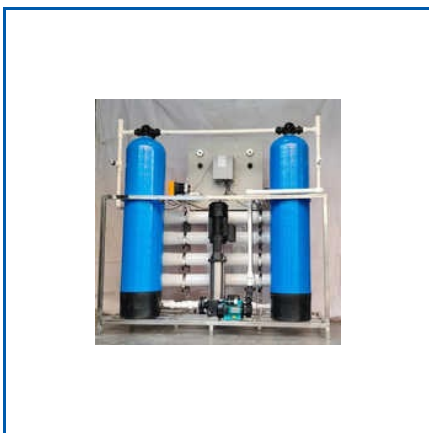
FRP REVERSE OSMOSIS PLANT

100 KLD Commercial Sewage Treatment Plant, 100 KLD Sewage Treatment Plant, 100 LPH Reverse Osmosis Industrial Water Purifier Plants, 100 LPH Reverse Osmosis Water Purifier System, 1000 BPH Bottle Blowing Machine, 1000 LPH Commercial Reverse Osmosis System, 1000 LPH Domestic Iron Removal Plant, 1000 LPH RO Plant, 1000 LPH Water Softening Treatment Plant, 1000 Ltr Reverse Osmosis System, 10000 LPH RO Plant, 10000 LPH SS RO Plant, 1500 BPH Pet Blow Moulding Machine, 1500 LPH Iron Removal System, 2 Phase Packaged Drinking Water Filling Machine, etc.