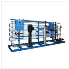
Industrial Reverse Osmosis Plant