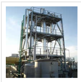
Industrial Distillation Water Treatment Plant