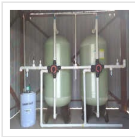
1000 LPH Water Softening Treatment