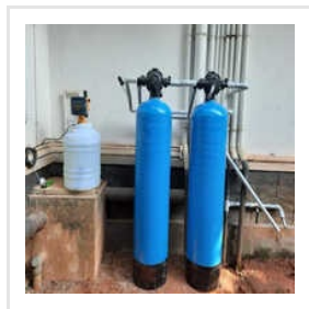
Mild Steel Water Purification System