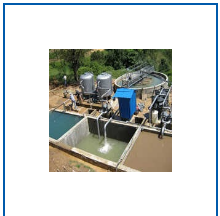
INDUSTRIAL EFFLUENT TREATMENT PLANT