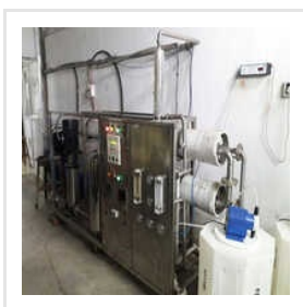
Industrial LPH RO Plant