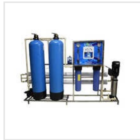
Industrial Reverse Osmosis Water Purifier