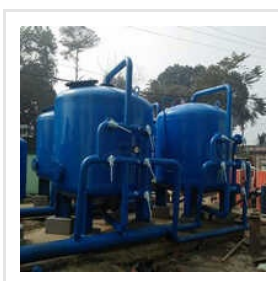
Mild Steel Water Treatment Plant