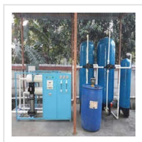
2000 LPH RO Plant