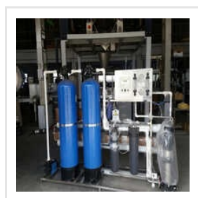
Industrial RO Water Filter