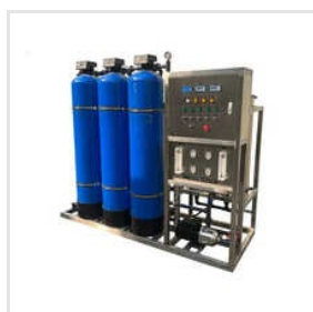
Dialysis Water Treatment Plant