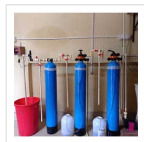
Industrial DM Water Plant