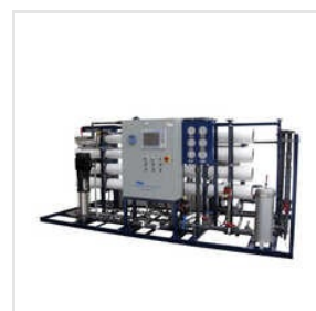
Stainless Steel Industrial RO Plant