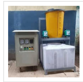
Mild Steel Electro Chlorination Plant