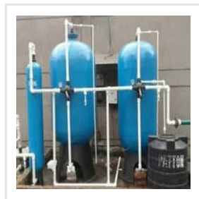
Industrial Water Filtration Plant