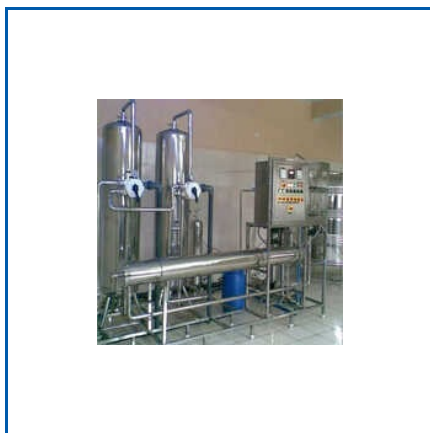
4000 LPH FULLY SS RO PLANT