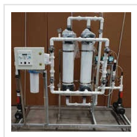
Industrial Ultrafiltration Plant