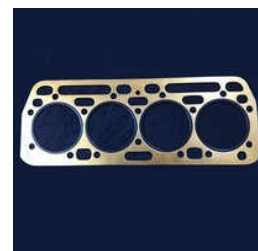
INTER CYLINDER HEAD GASKET