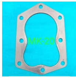
MK 20 Head Gasket