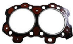
1.05 MM CYLINDER HEAD GASKET

0.02 To 3 MM Copper Shims And Foils, 0.5 MM Cylinder Head Gasket, 1.05 mm Cylinder Head Gasket, 1.8 mm Kubota Head Gasket, 80mm Cylinder Head Gasket, Bullet Cylinder Head Gasket, Comet Aircool Cylinder Head Gasket, Comet Cylinder Head Gasket, Cylinder Head Cornet Gasket, Index Cylinder Head Gasket, Industrial Copper Washer, Inter Cylinder Head Gasket, Lister 6-1 Five Hole Bracket Gasket, Lister 6-1 Head Gasket, Lister BKT Cherry Gasket, etc.