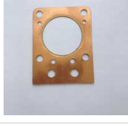
Cylinder Head Cornet Gasket