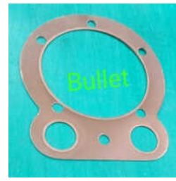
Bullet Cylinder Head Gasket