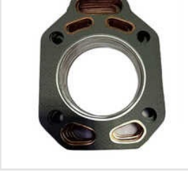
1.8 Mm Kubota Head Gasket