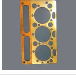
MF 135 Tractor Head Gaskets