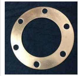
Peter Aircool Cylinder Head Gasket