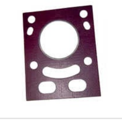
Water Cooled Diesel Engine Head Gasket