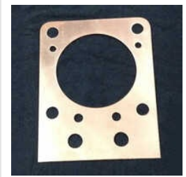
Comet Cylinder Head Gasket