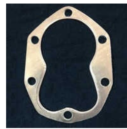
Mk-12 Cylinder Head Gasket