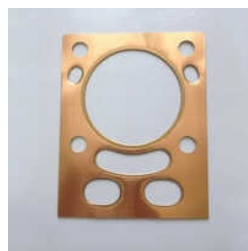
80MM CYLINDER HEAD GASKET