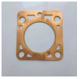
0.5 MM Cylinder Head Gasket