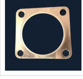
Comet Aircool Cylinder Head Gasket