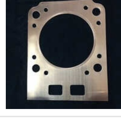
Vota Cylinder Head Gasket