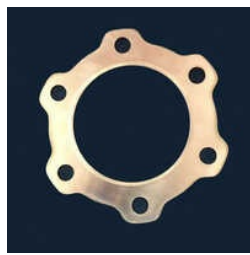
Indek Cylinder Head Gasket