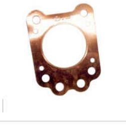
Submersible Pump Gasket