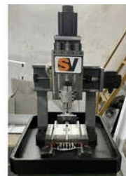
CNC MINI MILLING MACHINE