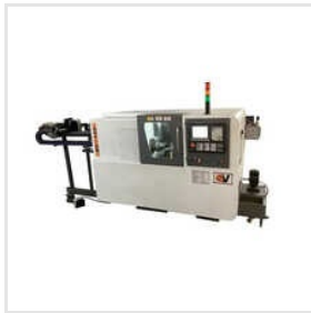
Industrial CNC Lathe Machine