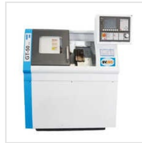
CNC Trainer Lathe And Milling Machine