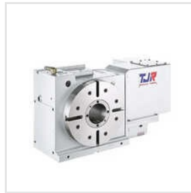
CNC TJR Rotary Table Machine