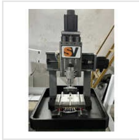
Cnc Mini Milling Machine