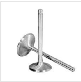
Two Wheeler Engine Valve