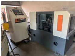
CNC HORIZONTAL MILLING MACHINE

Auto Pallet Changer for VMC, CNC Horizontal Milling Machine, CNC TJR Rotary Table Machine, CNC Trainer Lathe And Milling Machine, CNC XY Table Machine, CNC XYZ Table Machine, Cnc Mini Milling Machine, Flatbed CNC Lathe Machine, Industrial CNC Lathe Machine, Industrial SPM Machine, SV VMC 1200 Vertical Centers Machine, Two Wheeler Engine Valve, Vertical Center Machine, etc.