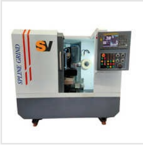
Industrial SPM Machine