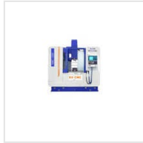
SV VMC 1200 Vertical Centers Machine