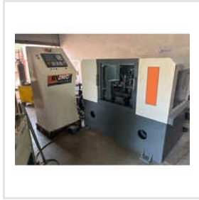
CNC Horizontal Milling Machine