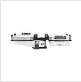
Auto Pallet Changer For VMC