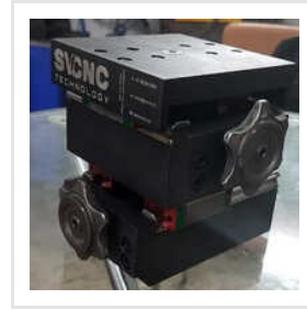
CNC XY Table Machine