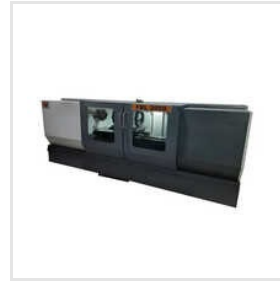
Flatbed CNC Lathe Machine