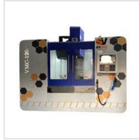
Vertical Center Machine