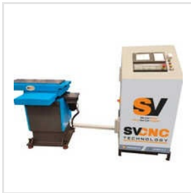
CNC XYZ Table Machine