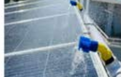
Solar Automatic Panel Cleaning Service