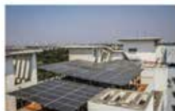
Residential Solar Power System