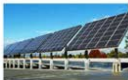
Commercial Solar Power System