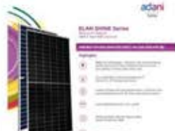
Adani Solar Panels Near Ahmedabad