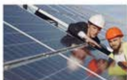
Solar Panel Operation And Maintenance