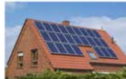
Mounting Structure Solar Rooftops