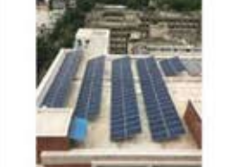
Single Phase Solar Rooftops