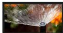
Solar Panel Cleaning System