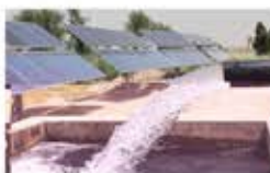
INDUSTRIAL SOLAR PUMPING SYSTEM