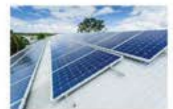
4 Kwh Commercial Solar Rooftop System