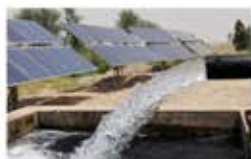
Solar Water Pumping System