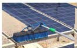
Automatic Solar Cleaning System