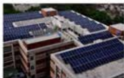
Institutional Solar Power System