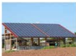
Solar Rooftop System