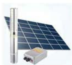
10 HP AC SUBMERSIBLE SOLAR PUMP SET

1 Hp Solar Pump Controller, 10 Hp Ac Submersible Solar Pump Set, 10 Hp Dc Solar Submersible Pump, 100w All In One Solar Street Light, 15Hp Solar Submersible Pump, 25 Hp Solar Submersible Pumps, 3 Hp Ac Solar Pump, 3 Hp Dc Solar Submersible Pump, 30 Hp Solar Water Pump, etc.