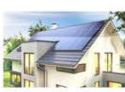
Customized Solar Rooftop Bungalow