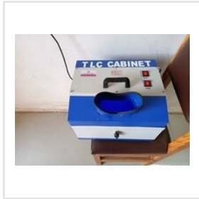
TLC UV Cabinet