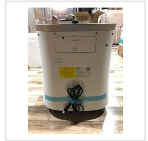
Oxygen Concentrator 5 Lpm