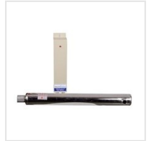
UV SYSTEM CME-2