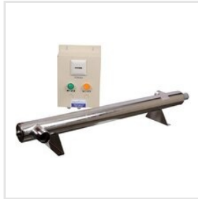
UV SYSTEM CME-10