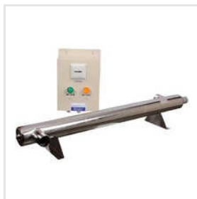
UV Purification Disinfection System