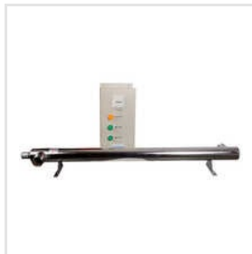
Sun Ultraviolet UV System