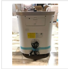
Oxygen Concentrator 10 Lpm