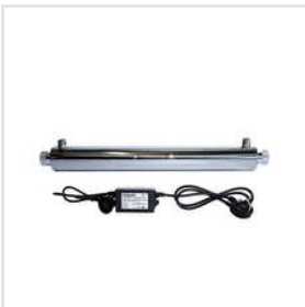
UV Wastewater Disinfection System