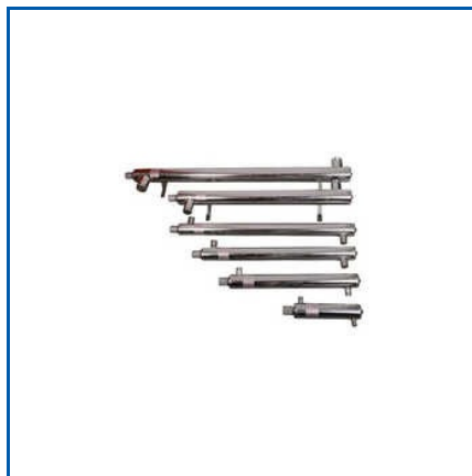
UV STERILIZERS DISINFECTION SYSTEM