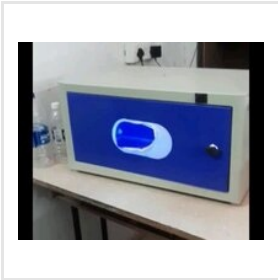
Jumbo UV Cabinet