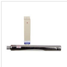
Uv Disinfection System