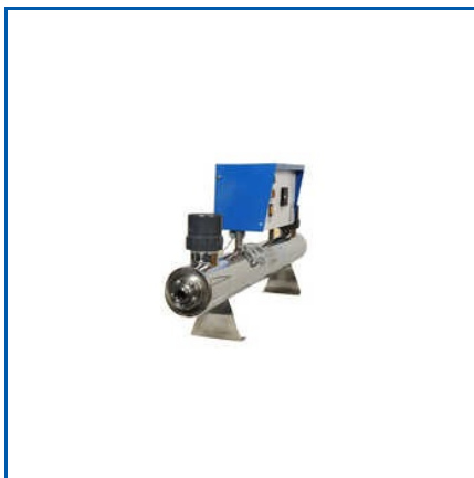
LOW FLOW UV DISINFECTION SYSTEM

A UV System for Industrial Water, constructed from stainless steel with customizable sizes, exhibits a sleek silver finish in new condition. Designed for commercial applications, it employs ultraviolet (UV) technology to treat water. An Ozone Generation System utilizes electrical energy to produce ozone, with an output of 100 grams per hour.