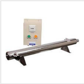
Domestic UV System