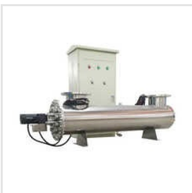
Industrial UV Disinfection System