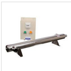
Uv System For Industrial Water