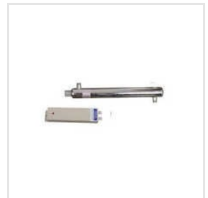
UV Disinfection System