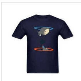
Half Sleeve Printed T Shirt