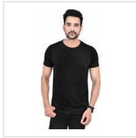
Men Round Neck Polyester T Shirt