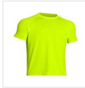
Poly Cotton Men T Shirts