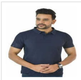
Tech Ultra Dry T-Shirts