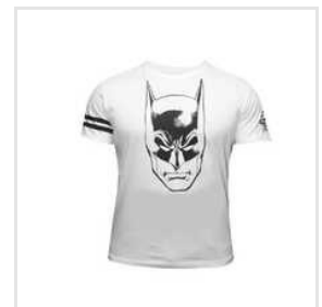
Round Neck Printed T-Shirt