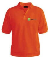
POLO NECK MENS T SHIRT

100% Cotton Premium Half Sleeves Plain T Shirt, 3 Layer Reversible Jacket, BJP Logo Printed Tshirt For Election Campaign, Barcode Shorts, Collar Knitted Fabric T-shirts, Colored Plain T Shirts, Congress Logo Printed Tshirt For Election Campaign, Cotton Printed T Shirts, Cotton Shorts, Custom Logo Printed T Shirt, Customized Men T-Shirts, Double Shade Colour Block T-Shirt, Dry Fit Round Neck T-shirts, Dry Fit collar Plain Red T Shirt, Half Sleeve Printed T Shirt, etc.