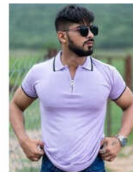
COLLAR KNITTED FABRIC T-SHIRTS