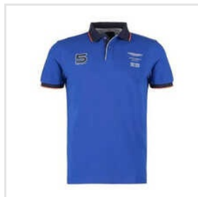
Polo Neck Mens T Shirt