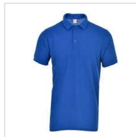
Men JK Original