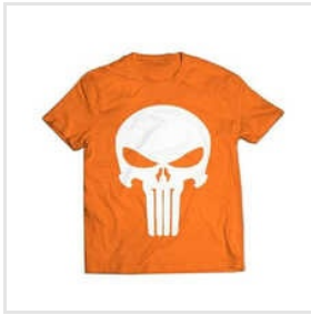
Cotton Printed T Shirts