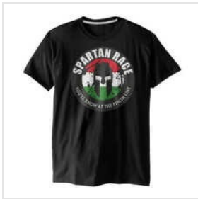
Custom Logo Printed T Shirt