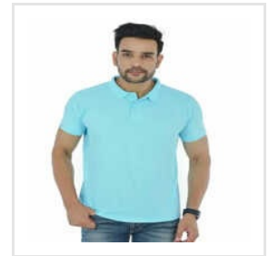
Mens Half Sleeve Collar T Shirt