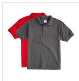
Mens Cotton T Shirts