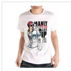
Mens Printed T Shirt