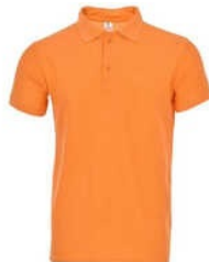
MEN JK ASPIRE ORANGE COLOR T SHIRT