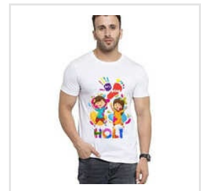
Holi Magic Colour Printed T-Shirt