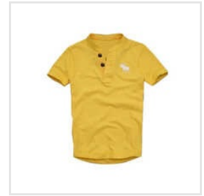
Mens Collar T Shirt