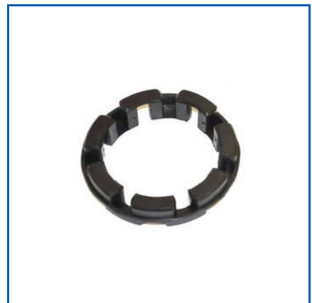
NM SPIDER COUPLING