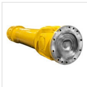
Universal Drive Joint Shaft