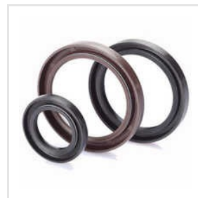
Rotary Shaft Seal