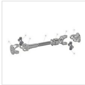
Unique Cardan Shaft