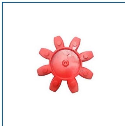
ROTEX KTR GS SPIDER COUPLING