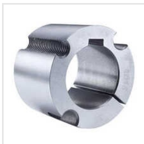
Taper Lock Bush