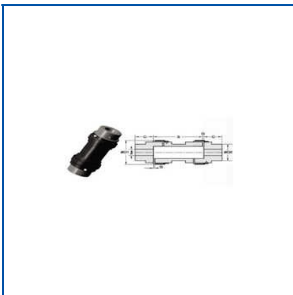
EXTERNAL SPIDER ALUMINUM SPACER COUPLING

Continental V Belt, Continental Gear Coupling, Continental Pin Bush, External Spider Aluminum Spacer Coupling, External Spider Jaw Coupling, High Quality Pneumatic Sealing, Hydraulic Seal, Industrial Portable Shaft, NM Spider Coupling, Rotary Shaft Seal, Rotex Ktr GR Spider Coupling, Rotex Ktr GS Spider Coupling, Standard Jaw Coupling, Standard Spacer Coupling, Taper Bush Pulley, etc.