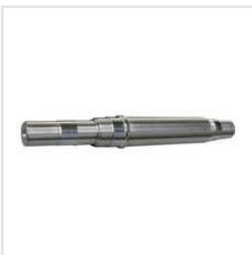
Industrial Portable Shaft