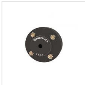
Continental Pin Bush