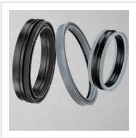
High Quality Pneumatic Sealing