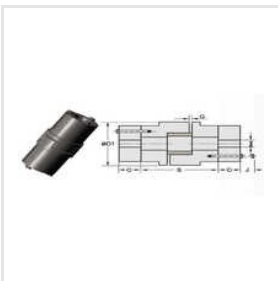
Standard Spacer Coupling