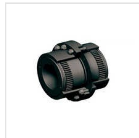
Continental Gear Coupling