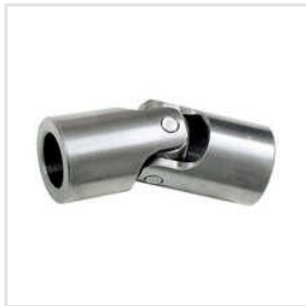
Universal Joint Drive Shaft