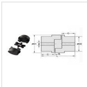
Standard Jaw Coupling