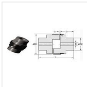
External Spider Jaw Coupling