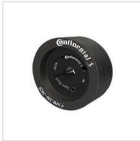
Taper Bush Pulley