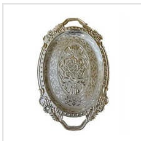
Small Sweety Silver Plated Plastic Tray