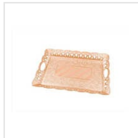
Copper Plated Tray