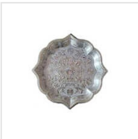
Silver Plated Serving Tray