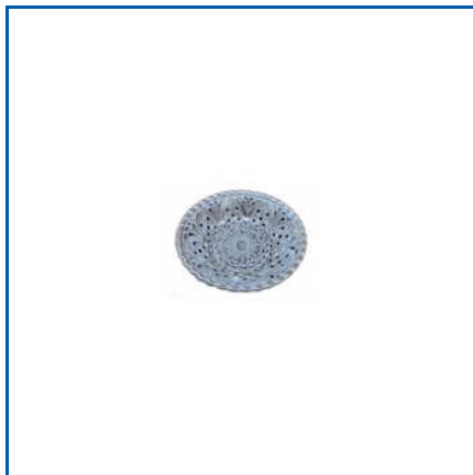
DESIGNER SILVER PLASTIC POOJA THALI