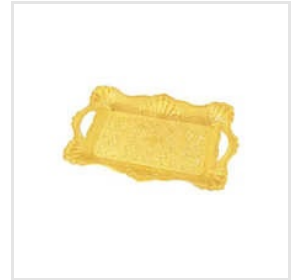
Gold Plated Tray