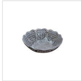
Designer Silver Plated Fruit Basket