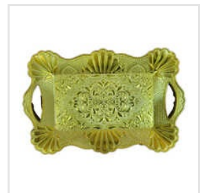
120 Silver Plated Plastic Tray