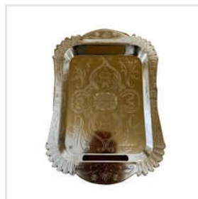
Plastic Serving Tray