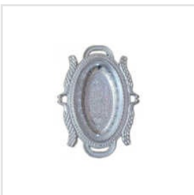
Fancy Silver Plated Plastic Tray