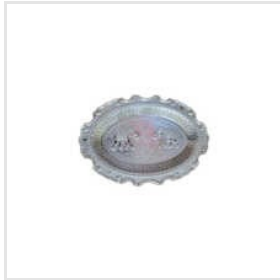
Oval Silver Plated Plastic Tray