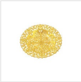
Decorative Wedding Gift Hamper Tray