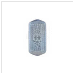
Deluxe Silver Plated Plastic Tray