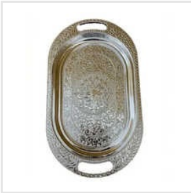
Gifting Silver Plated Plastic Tray