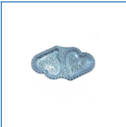
DESIGNER SILVER PLATED TRAY DOUBLE HEART

1 Tier Cloth Drying Stand, 1000 MI Fruit Vegetable Chopper, 1000ml Square Chopper For Vegetables, 18Ltr Virat Water Camper, 2 Tier Cloth Drying Stand, 600ml 2 In1 Square Turbo Handy Chopper, 950 MI Kitchen Chopper, Aluminium Hand Juicer, Aluminium Hand Press Juicer, Aluminum Hand Juicer, Apple Silver Plated Plastic Tray, Big Peacock Silver Plated Plastic Tray, Butterfly Clothes Drying Stand, Cloth Drying Stand, Cloth Drying Stand Plastic Parts, etc.