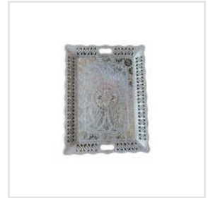
Dubai Silver Plated Plastic Tray