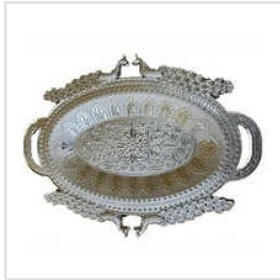
Big Peacock Silver Plated Plastic Tray