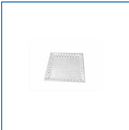
DUBAI 4 SILVER PLATED TRAY