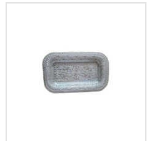
Apple Silver Plated Plastic Tray