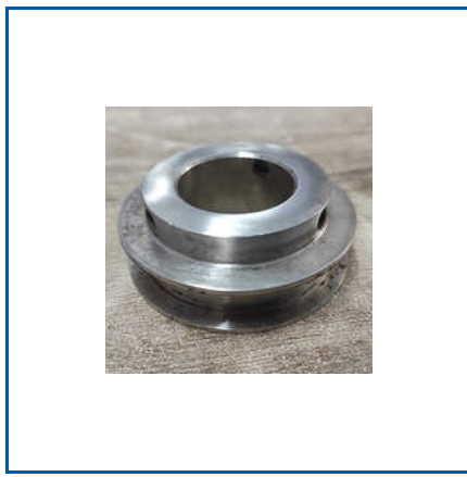
MILD STEEL BUSH