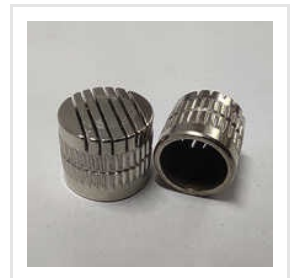
MS Slotted Core Air Vent