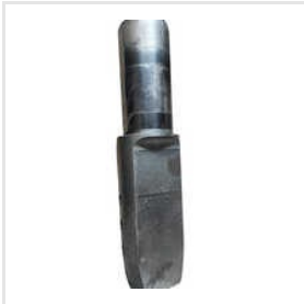
MS Cutting Tool Holder