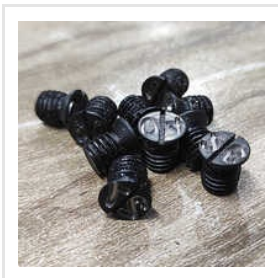
Metal Date Shift Punch Screw