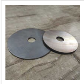
MS Die Packing Plate