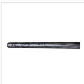
MS Ejector Pin