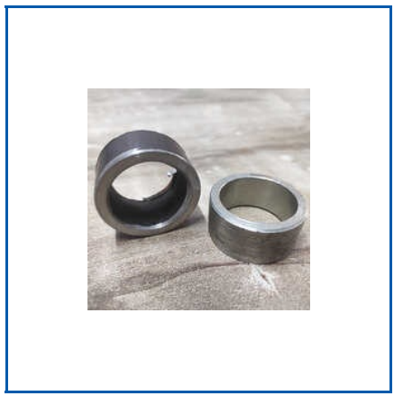
CARBON STEEL BUSH