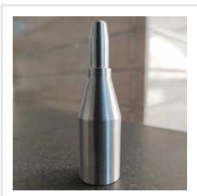
MS Cavity Pin