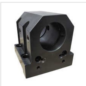
High Quality Tool Holder