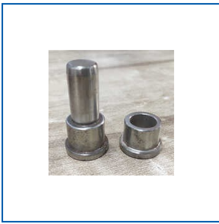
GUIDE PILLER BUSH

560 B Bore Hub Guage, Carbon Steel Bush, Conical Bush, Guide Piller Bush, High Quality Tool Holder, Industrial Jig Fixture, MS Cavity Pin, MS Collet, MS Cutting Tool Holder, MS Die Packing Plate, MS Ejector Pin, MS Lower Adapter, MS Round Tapper Bush, MS Slotted Core Air Vent, Metal Date Shift Punch Screw, etc.