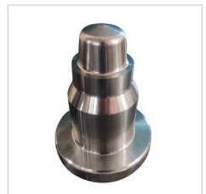
MS Lower Adapter