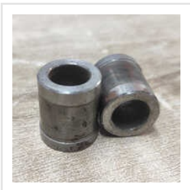
MS Round Tapper Bush