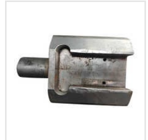
Ms Tool Pocket