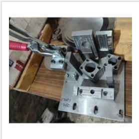
Industrial Jig Fixture