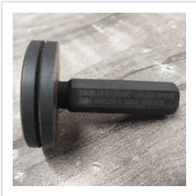
560 B Bore Hub Gauge