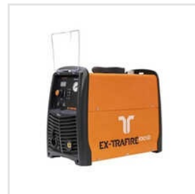
Ex Trafire 100SD Air Plasma Cutting