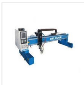
Heavy Gantry Type CNC Cutting Machine