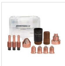
Hypertherm Pmx 105 Plasma Consumables