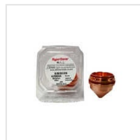
420044 Hypertherm Max Pro 200 Nozzle