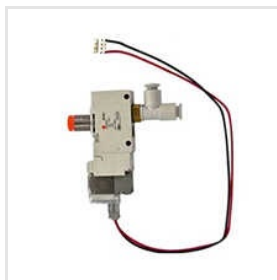
Hypertherm 228285 Solenoid Valve