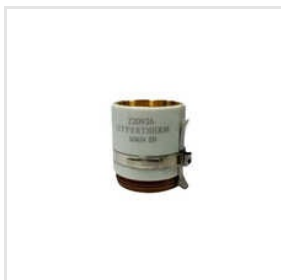
Hypertherm Max Pro 200 Retaining Cap