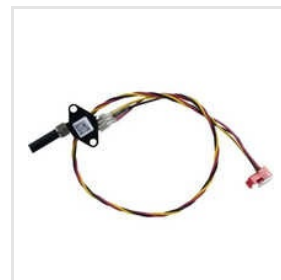
Hypertherm 228689 PMX65 Pressure Sensor