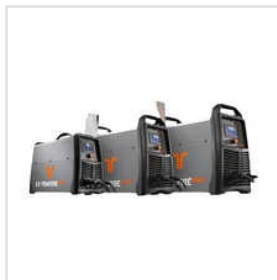
Ex Trafire 125HD Air Plasma Cutting