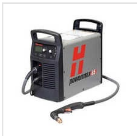
Hypertherm Powermax 65 Plasma Cutter