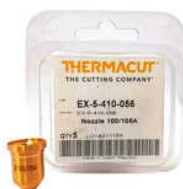
THERMACUT PLASMA CONSUMABLES