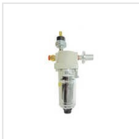
Powermax 65-85-105-125 Air Filter