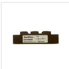
Hypertherm Powermax 85 Output Diode