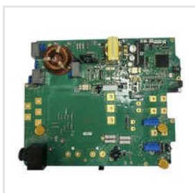
Hypertherm 228672 Kit