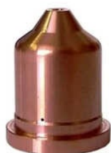
HYPERTHERM PLASMA NOZZLES

220842 Hypertherm Plasma Cutting Electrode, 220936 Hypertherm Max Pro 200 Retaining Cap, 220937 Hypertherm Plasma Cutting Electrode, 400 Amp Arc Welding Machine, 420044 Hypertherm Max Pro 200 Nozzle, Ex Trafire 100SD Air Plasma Cutting Machine, Ex Trafire 125HD Air Plasma Cutting Machine, Heavy Gantry Type CNC Cutting Machine, Hypertherm 105 Output Diode, Hypertherm 228285 Solenoid Valve, Hypertherm 228672 Kit, Hypertherm 228689 PMX65 Pressure Sensor, Hypertherm Max Pro 200 Retaining Cap, Hypertherm Max Pro 200 Shield, Hypertherm Maxpro 200 Plasma Consumables, etc.