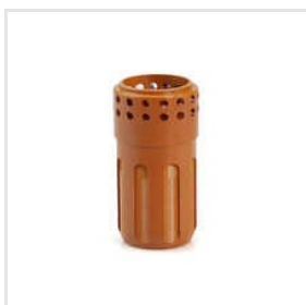
Plasma Swirl Ring