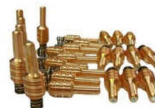
HYPERTHERM MAXPRO 200 PLASMA CONSUMABLES