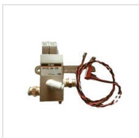
Hypertherm Solenoid Valve