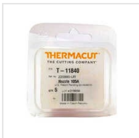
T-11840 Nozzle 105A Thermacut