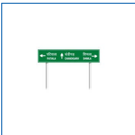
CANTILEVER SIGN BOARD

Bumps Sign Board, Bus Passenger Waiting Shelter, Bus Queue Shelter, Bus Shelter Services, Bus Stop Prefabricated Shelters, Cantilever Sign Board, Cantilever Sign Boards, Car Parking Tensile Structure, Cat Eye Road Stud, Construction Zone Sign Board, Customized Toll Plaza Canopy, Direction Sign Board, Drive Safely Sign Board, Electric Vehicle Charging Station Shelter, Foot Overbridge Fabrications Services, etc.