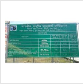
Toll Plaza Sign Board