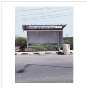
MS Bus Stop Shelters