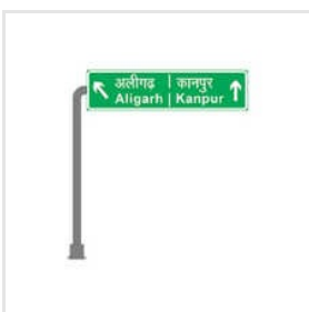
Cantilever Sign Boards