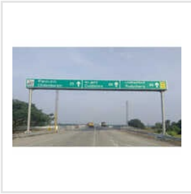
Overhead Gantry Sign Board