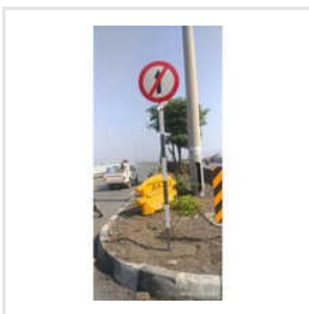
Traffic Sign Board