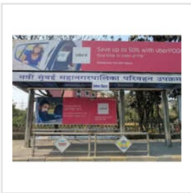
Bus Queue Shelter