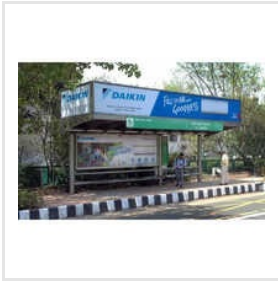
SS Bus Stop Shelters