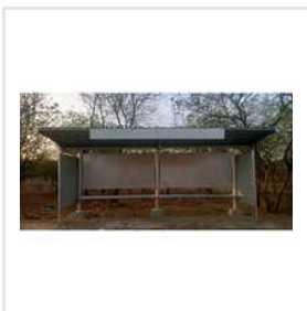
Bus Passenger Waiting Shelter