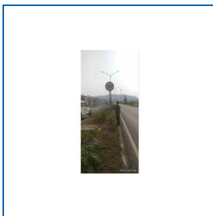
SPEED LIMIT SIGN