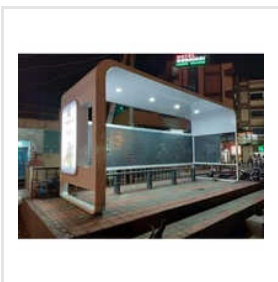
Modular Bus Stop Shelters