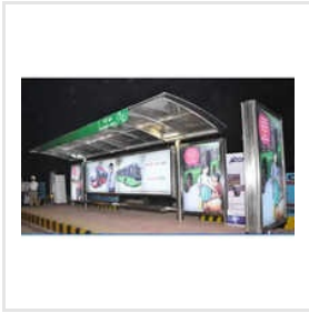
Stainless Steel Bus Stand Shelter