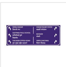
Direction Sign Board