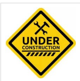
Construction Zone Sign Board