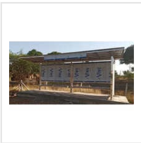
Passenger Waiting Shelter