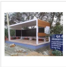
Smart Bus Stop Shelter