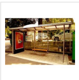
Modern Bus Stop Shelter