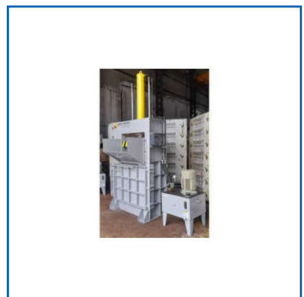
PAPER SCRAP BALING PRESS MACHINE