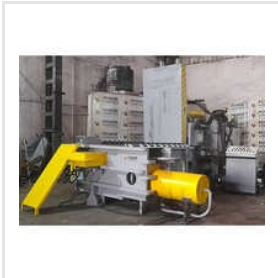
Aluminum Can Baler Machine