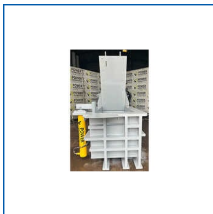
PORTABLE SCRAP BALING PRESS MACHINE