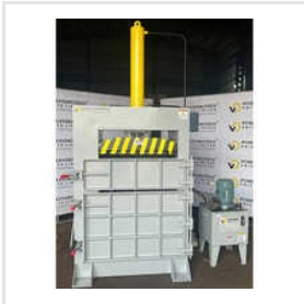
Single Box Paper Baling Press Machine