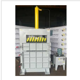
Vertical Cardboard Baler Machine