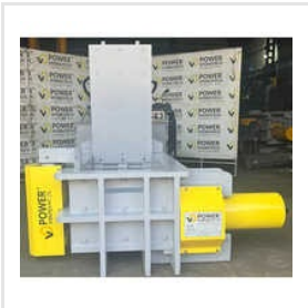
Iron Scrap Baling Press Machine