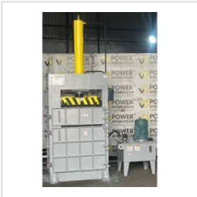
Industrial Paper Baler Machine