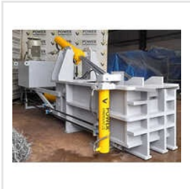
Industrial Scrap Baling Press Machine