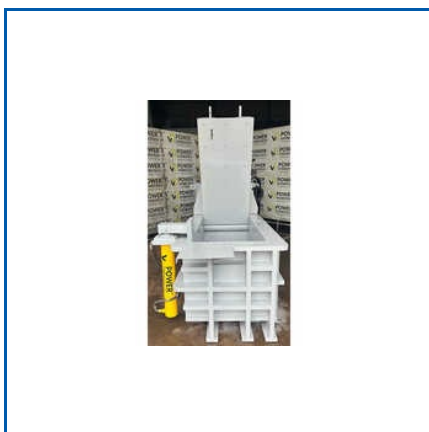
MS SCRAP BALING PRESS MACHINE

Aluminum Can Baler Machine, Aluminum Economy Baler Machine, Automatic Horizontal Auto Tie Baler Machine, Bandal Baling Press Machine, Coir Fibre Baling Machine, Commercial Baler Machine, Compactor Cardboard Baler Machine, Copper Baler Machine, Corrugated Cardboard Baler Machine, Double Chamber Baling Machine, Ferrous Baling Press Machine, etc.