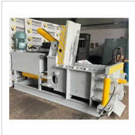
Old Scrap Baling Press Machine