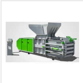
Waste Cardboard Baler Machine