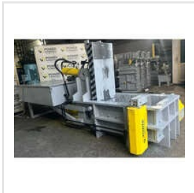
Hydraulic Aluminum Can Baler Machine