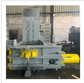
Metal Scrap Baling Press Machine