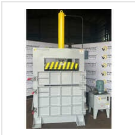
Corrugated Cardboard Baler Machine