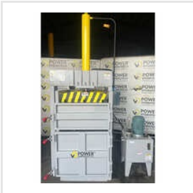
Compactor Cardboard Baler Machine