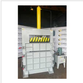
Single Cardboard Baler Machine