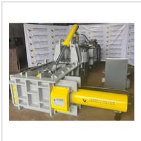
Aluminum Economy Baler Machine