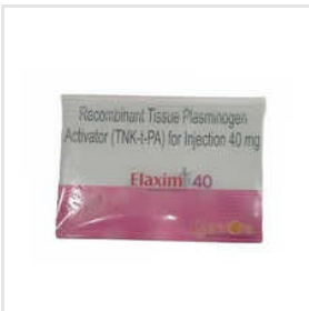
Recombinant Tissue Plasminogen Activator