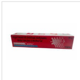
Omnigel 50mg For Fast Relief From Pain Sprain