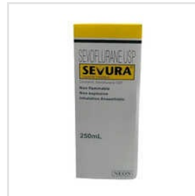
250ml Sevura Sevoflurane USP