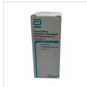
Amoxicillin Potassium Clavulanate Oral