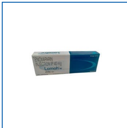
40MG LOMOH ENOXAPARIN INJECTION