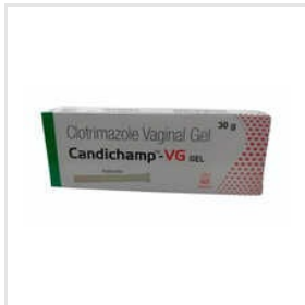
30g Clotrimazole Vaginal Gel