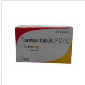
20mg Isotretinoin Capsules IP