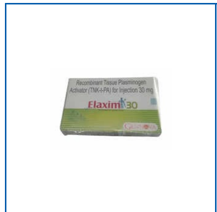
30MG RECOMBINANT TISSUE PLASMINOGEN ACTIVATOR FOR INJECTION