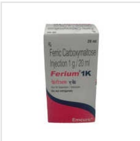
20ml Ferric Carboxymaltose