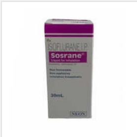
30ml Liquid Isoflurane IP