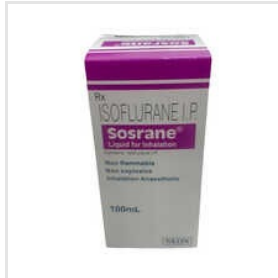
100ml Isoflurane IP