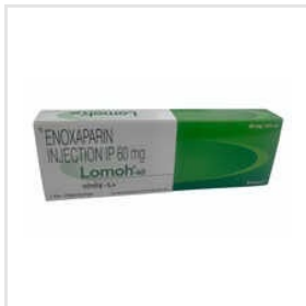
60mg Exoxaparin Injection IP