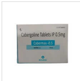
0.5mg Cabergoline Tablets IP