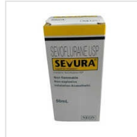
50ml Sevura Sevoflurane USP