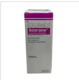
250ml Isoflurane IP