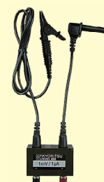
8302 Adapter for recorder (Output 1mV/1μA)