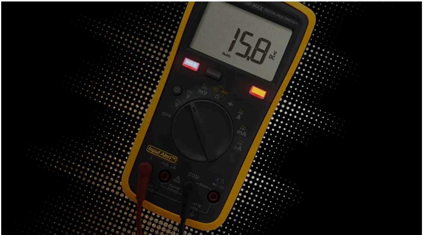
Audible and visual alarm for incorrect connections